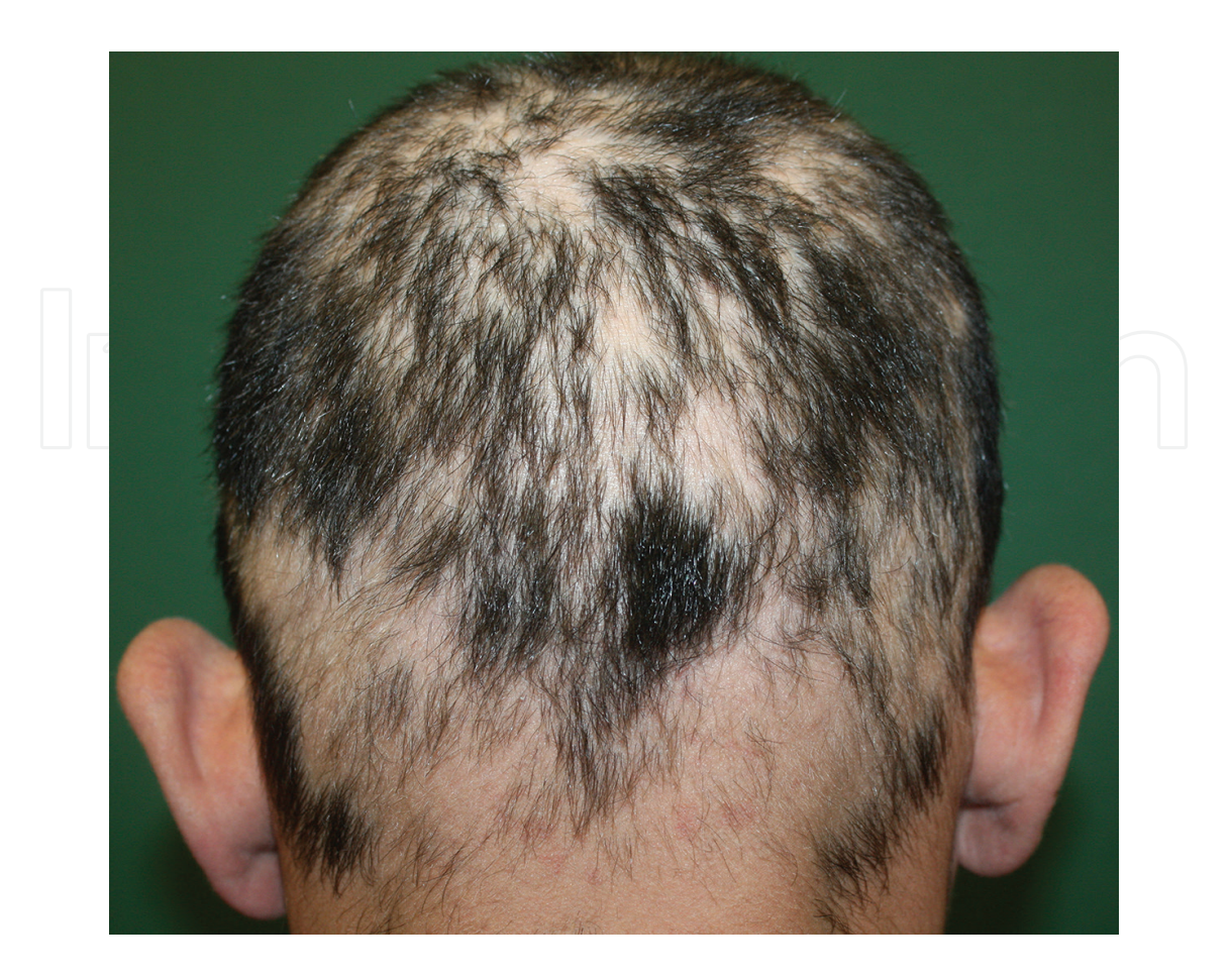
Figure 3. Reticular type alopecia areata with a net-like pattern.