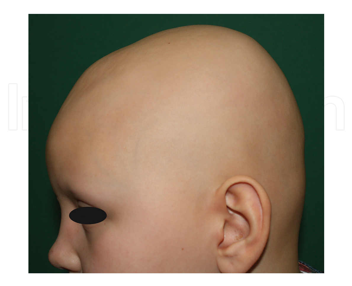
Figure 2. A patient with alopecia universalis having total loss of scalp hair and eyebrows.

ous candidiasis-autoimmune adrenal insufficiency) was recently reported [20]. Patients with Down's syndrome or Turner's syndrome also have increased risk of alopecia areata [17].