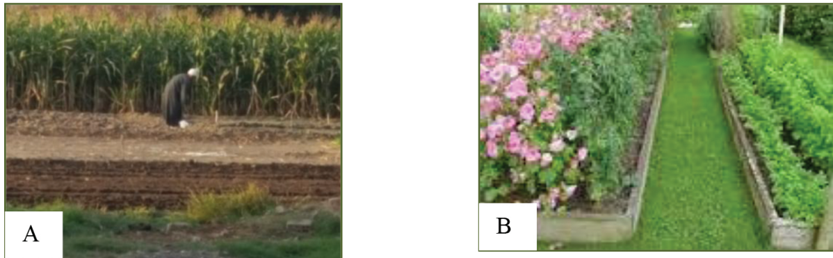
Figure 1. Complete removal of maize may eliminate natural enemies (A) or after roses cutting (B).

Figure 1. Collection and transferring of natural enemies to environmentally controlled habitats could be useful in utilizing these natural enemies until releasing them in the next crop season.