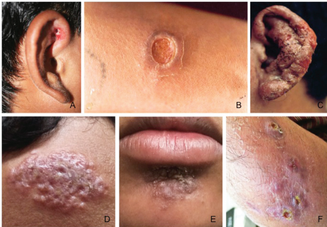
Figure 1. Clinical spectrum of the LCL in southeastern Mexico. (A) Acute ulcerated lesion on ear; (B) typical small, rounded, ulcerated lesion in forearm; (C) chronic lesion on ear; (D and E) nodular infiltrated lesions; (F) multiple ulcerated lesions in forearm.

appearance of multiple lesions ( Figure 1D–F ). Those findings are suggestive of changes in pathogenicity of the parasite that need to be studied.