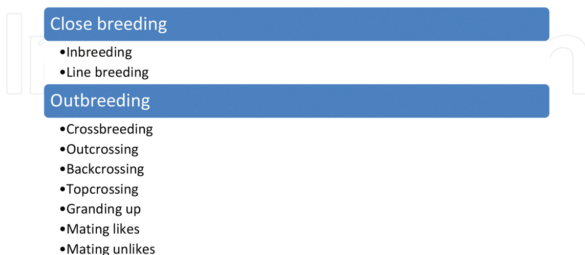
Figure 3. Types of cattle breeding methods.

One of the oldest methods for desirable cattle production involves breeding both close breeding and outbreeding ( Figure 3 ). A popular and effective method of outbreeding, known as crossbreeding, involves breeding animals of pure breeds within each generation to produce desired animals. There are two main categories that fall under the crossbreeding umbrella: terminal- and rotational-crossing. Terminal-crossing is utilized more for meat animals and not dairy animals as it does not involve the progeny of breeding, but rather is slaughtered for commercialized meat. Whereas rotational-crossing involves the breeding of two breeds and utilizing the female offspring to breed with a sire of a different bred. The female offspring of this breeding sequence is introduced to one of the two breeds used in the original breeding scheme [1]. These techniques are particularly important when seeking heterosis. Heterosis is the improvement or enhancement of a specific trait that involves three types of improvement with respect to fertility: individual affecting the calf, maternal affecting the dam, and paternal affecting the sires. Individual heterosis increases live births and postnatal calf survival, while maternal increases conception rate, birth rates, and other economic traits such as milk product [2].