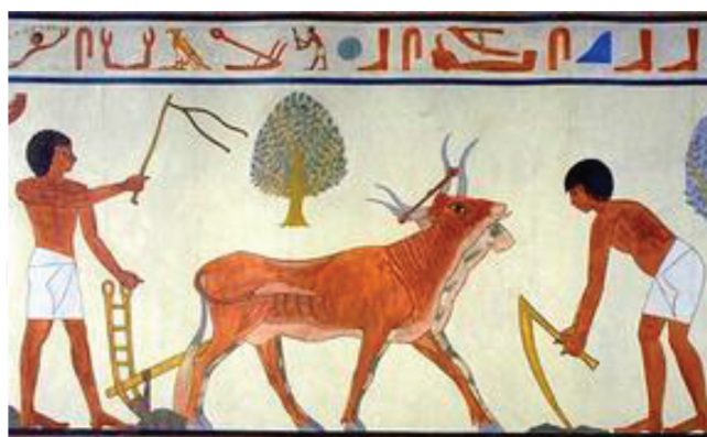
Figure 2. Untitled Egyptian art.

Today cattle remains a vital part in mankind's socio and economic progression through the same deliverables attained by their ancestors: food, clothing, and innovative tools. What worries the majority of cattle owners today is the pressure of supply and demand of meat and dairy products, which comes from sustaining high populations of cattle. Past and current