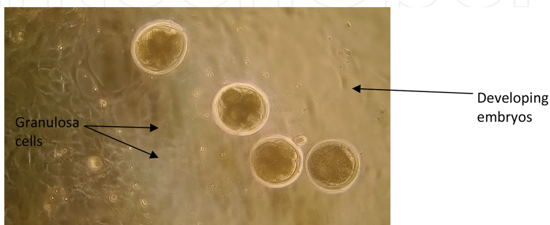
Figure 6. Picture of bovine granulosa cells utilized at the University of the Azores.

embryos through a granulosa cell theater [8]. This allows for the development of genetically desirable cattle through selection of genetic enhancement which can increase specific phenotypes of economically pleasing cattle. The study conducted at the University of Georgia showed that bovine granulosa cells can transfect desirable genes in vitro without negatively affecting embryo viability; essentially bovine granulosa cells are potentially useful passage cells to establish nuclear transfer of gene cloning [8]. Transgenic animals can add an advantage to the human therapeutic industry by providing preclinical theatres for vaccine production and tissue growth for human use.