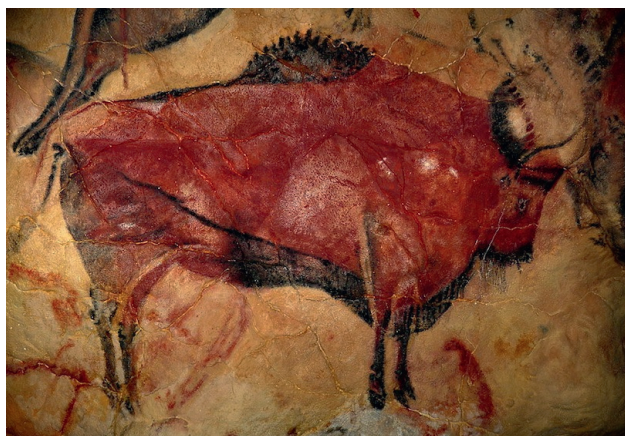
Figure 1. Untitled painting of ancient cave art.

citizens to witness the existence of cattle (such as the ox) not only as a creature of coexistence, but also as means of survival. As early as 8000 BC, the bovine species was domesticated as a means of a secure meat supply before becoming an essential object for clothes, tents, and even later becoming the main component in creating drums. Throughout history, cattles have been valuable not only as means of self-survival, but also played a major role in the art of agriculture and the conception of community. As the idea of growing food sources in one area (farming) grew more and more attainable the lifestyle of hunters and gathers phased into established communities with the help of cattle. The use of cattle as work tools for plowing fresh soil, as depicted in Figure 2 , and the importance of manure for crop fertilization allowed the human race to settle and create civilized communities.