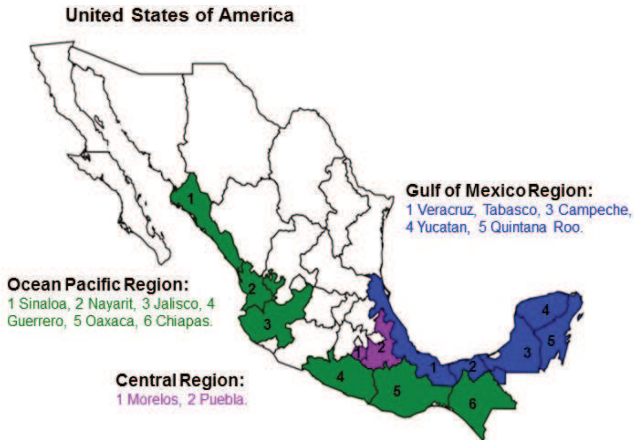
Figure 1. Map of Mexico, showing the Ocean Pacific, Gulf of Mexico, and Central Leishmaniasis endemic regions.

Veracruz, Nayarit and Chiapas, and Quintana Roo—or samples from VL patients from Chiapas and Tabasco states. The clinical samples were taken on filter papers or smears, needle aspirates, and tissue biopsy samples (1–2 mm) from the edge of cutaneous or bone marrow aspirates (Figure 1).