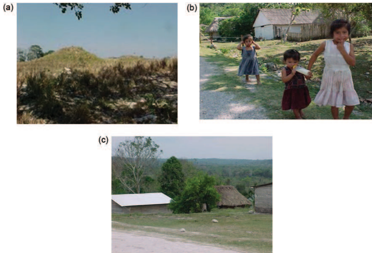
Figure 3. Communities situated in the leishmaniasis endemic region of Gulf of Mexico. People in these villages farm chili crops around their houses, located very near the forest close to the border of Belize and Guatemala.

characteristically tropical rain forest, with considerable rainfall and important agricultural activities, including the production of cocoa, sugar cane, and rubber. We collected isolates from patients with DCL or LCL in these states and some from Campeche. Their DNA was amplified with primers M1 and M2 [17] specific for kDNA of L. mexicana complex. The size of PCR products (680–720 bp) of the Mexican isolates is more similar to the size of the PCR products (700 bp) of L. (L.) amazonensis group than the PCR products (800–820 bp) of L. (L.) mexicana BEL21. The isolate PCR products hybridized with probe 9.2 specific for the L. mexicana complex. Their DNA was also analyzed using ITS1 PCR-RFLP, and we confirmed the presence of both DNA of L. (L.) amazonensis and L. (L.) mexicana in the same isolate (Table 2) [12, 17].