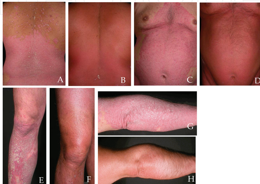
Figure 1. Plaque psoriasis before (A, C, E, G) and after (B, D, F, H) bath-PUVA therapy.

Bath-PUVA therapy consists in the immersion of the whole body in a bath containing an 8-MOP alcoholic solution, at concentrations ranging from 1 to 3 mg/L, for a time varying from 15' to 20'. Then, the patient is exposed to increasing doses of UVA, which varies in relation to the phototype, with a minimal initial doses of 0.25–0.50 J/cm 2 and progressive increments of 0.25 J/cm 2 up to a maximum of 5–7 J/cm 2 .