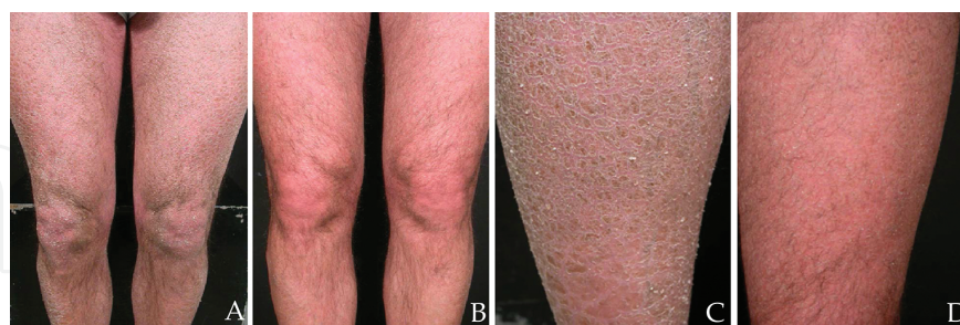
Figure 2. Ichthyosis-like atopic dermatitis before (A and C) and after (B and D) bath-PUVA therapy.

This modality of treatment minimizes short- and long-term side effects due to the systemic administration of the drug [19, 30–33]. Three hours after treatment, photosensitivity is negligible, due to the low systemic absorption of 8-MOP; thus, patients can avoid the use of photoprotectants, including sunglasses [34, 35]. Gas chromatography and mass spectrometry analyses have shown that plasmatic trioxolaren concentrations range between 0.27 and 12.5 ng/ml after the ingestion of a 0.6 mg/kg dose and between 9 ng/ml and 25 ng/ml after bath-PUVA [20, 36].