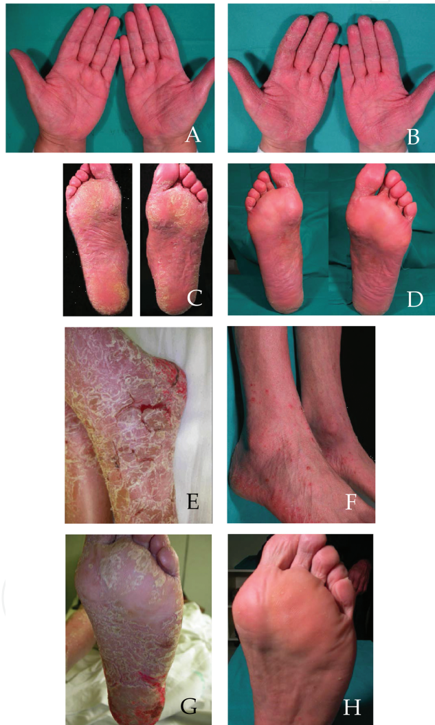
Figure 4. Palmoplantar psoriasis before (A and C) and after (B and D) gel-PUVA therapy; eczematized psoriasis before (E and G) and after (F and H) gel-PUVA therapy.

In the skin, the drug absorption peak occurs within 15–35 min; the maximum concentration is reached in the stratum corneum and the removal of this cell layer (by “stripping”) significantly enhances the possibility of drug penetration to the underlying layers. The higher psoralen