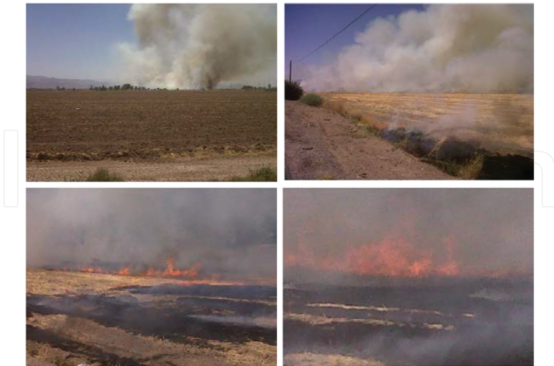
Figure 1. Wheat straw burning practices in Mexico.