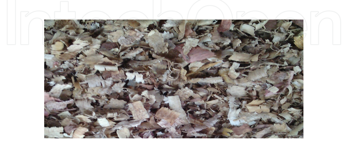
Plate I. A mixture of soft and hard wood shavings used as poultry litter in Zaria, Nigeria.

Soft or hard wood shavings from different trees are available year round in many places. These are normally obtained from the wood work and furniture enterprises. Wood shavings sourced from soft wood the best litter material but is highly demanded for making paper, fibreboard and cardboard making it difficult to obtain [10]. In some instances, the woods may be treated with some chemical preservatives like copper chrome arsenate or even organophosphates which may be harmful. Wood shaving is the most common poultry litter material which today is characterized by periodic shortage due to increasing number of poultry producers [8, 26]. Unfortunately, hard wood shavings are reported to poorly absorb moisture and are frequently contaminated with Aspergillus [9], showed highest prevalence of Salmonella organism [22] and posed a significant problem when obtained from chemically treated woods [4]. Wood shaving will be an ideal litter material if free of contaminants and if properly managed. Some countries are reported to specifically produce uniformly sized untreated soft wood shaving as litter material for poultry. Below is a plate ( Plate I ) showing a combination of soft and hard wood shavings used as litter material in many parts on Nigeria.