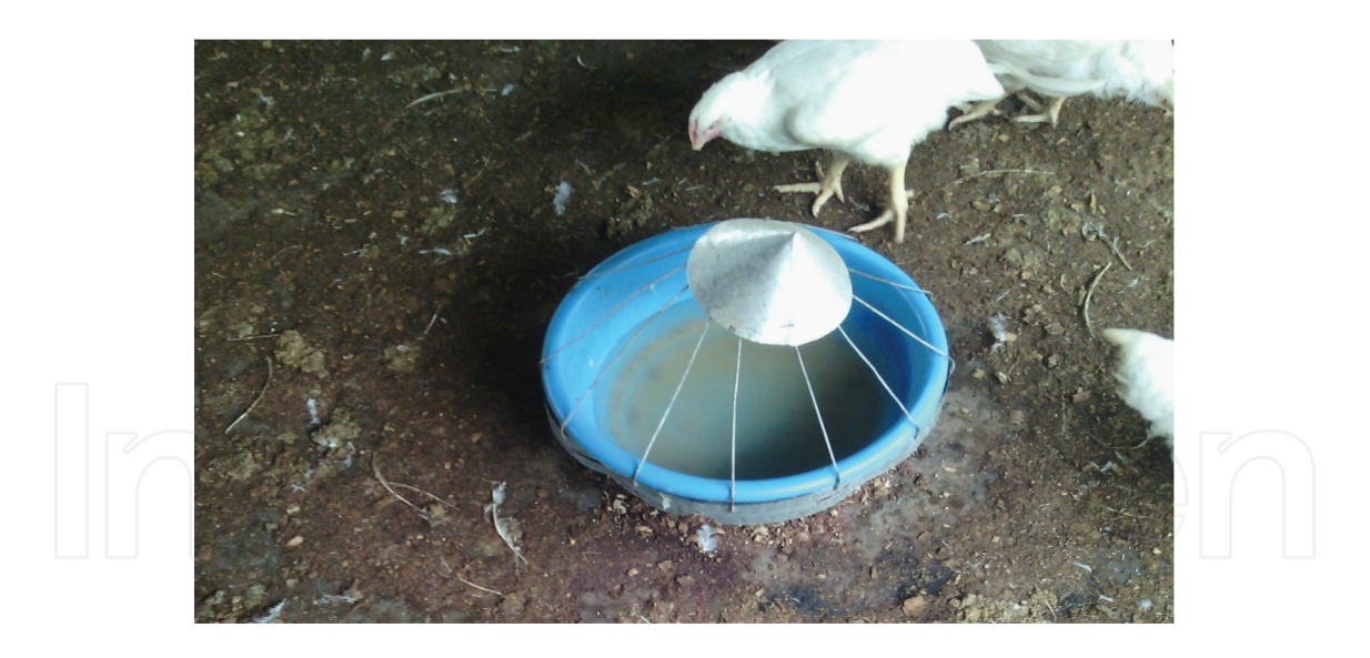
Plate IV. Inadequate and poorly managed litter around a drinker in Zaria, Nigeria.