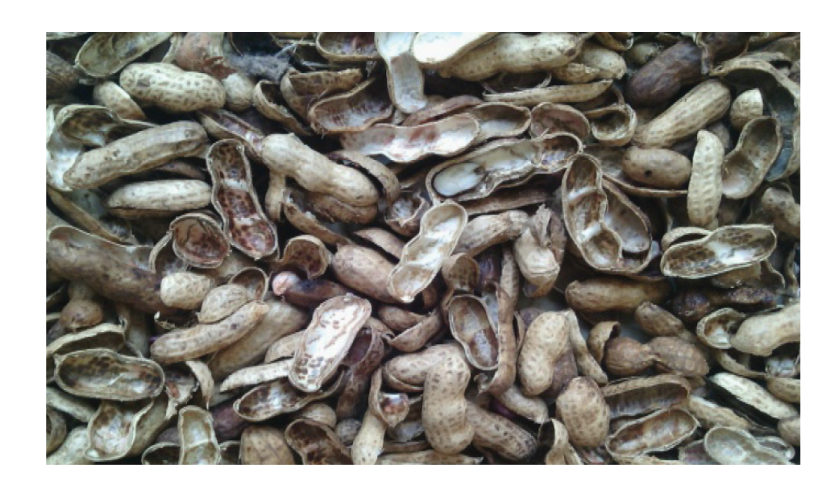
Plate III. Peanut/groundnut shells used as poultry litter material in some parts of Nigeria.

Groundnut or peanut shells as shown in Plate III below have been used alone or in combination with other litter materials where groundnut is cultivated in Nigeria. It only seems to protect birds from being in direct contact with the floor as its warming and moisture absorbing abilities are poor. It may, however, be obtained at no cost but its suitability as a good litter material needs further evaluation.