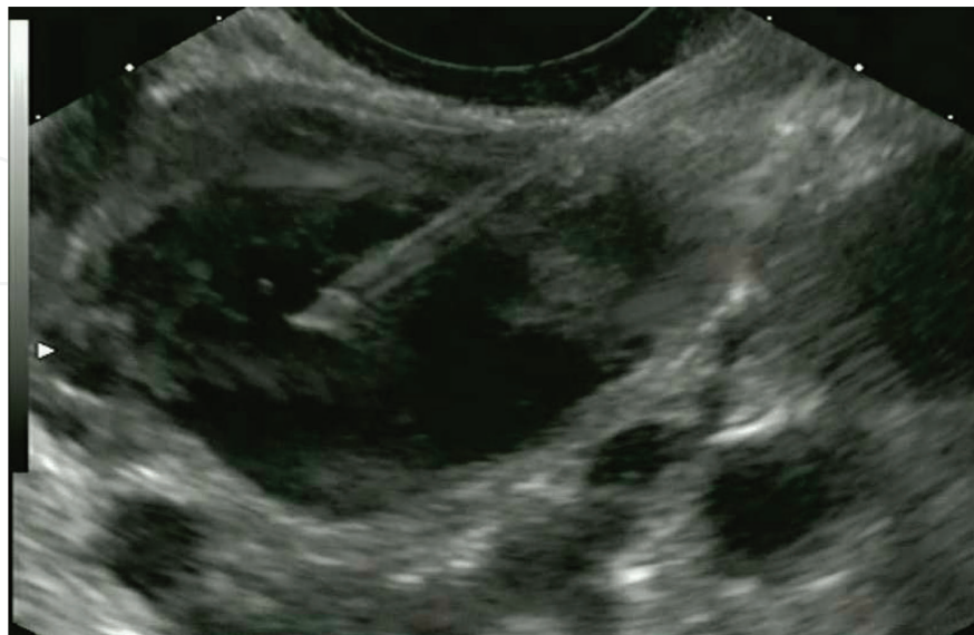
Figure 2. Cyst fluid evaluation-EUS/FNA—by Prof. Alizadeh.