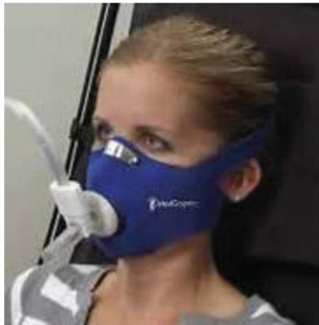
Figure 2. MedGraphics interface.