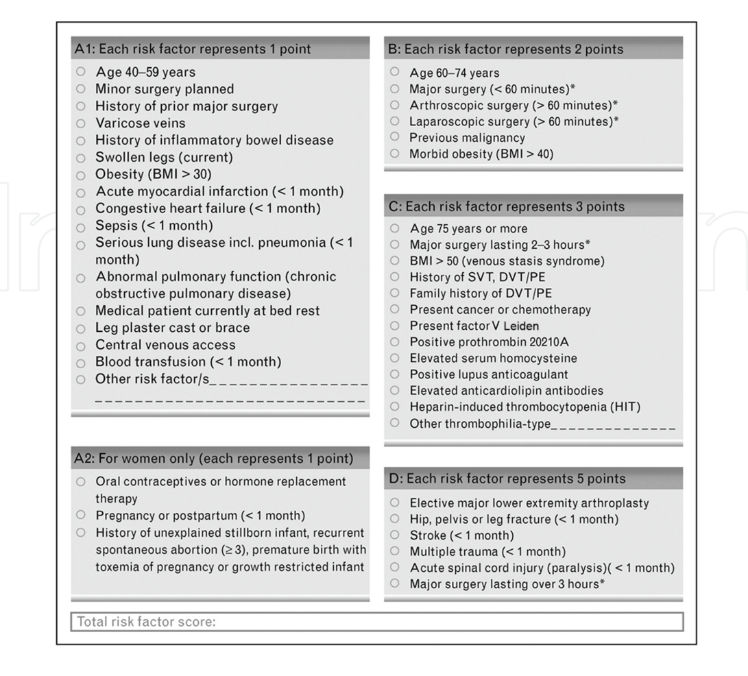
Figure 2. The 2010 Caprini risk assessment model. Risk assessment as a guide to thrombosis prophylaxis. Curr Opin Pulm Med. 2010.

The 2012 American College of Chest Physicians guidelines note that at any level of 2005 Caprini score, plastic and reconstructive surgery patients are at decreased risk of venous thromboembolism compared with patients undergoing abdominal and pelvic surgery [26]. Prior validation studies of the 2005 Caprini score in plastic and reconstructive surgery patients [27] and the head and neck surgery population [28] showed that 70–80% of patients in the overall population are classified as lower risk (2005 Caprini scores of 3–4 or 5–6). Thus, only a small proportion of patients fall into the highest risk strata.