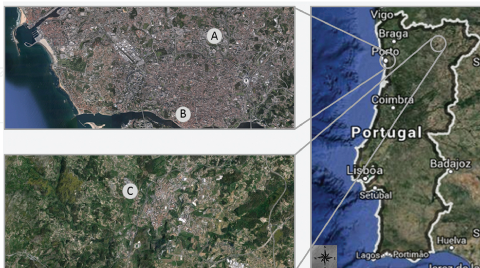
Figure 2. Spatial distribution of the three hospitals involved in the study (A and B in Porto and C in Vila Real, Portugal).

tive administration boards. The study was carried out according to the Helsinki Declaration. Figure 2 shows the location of these three hospitals.