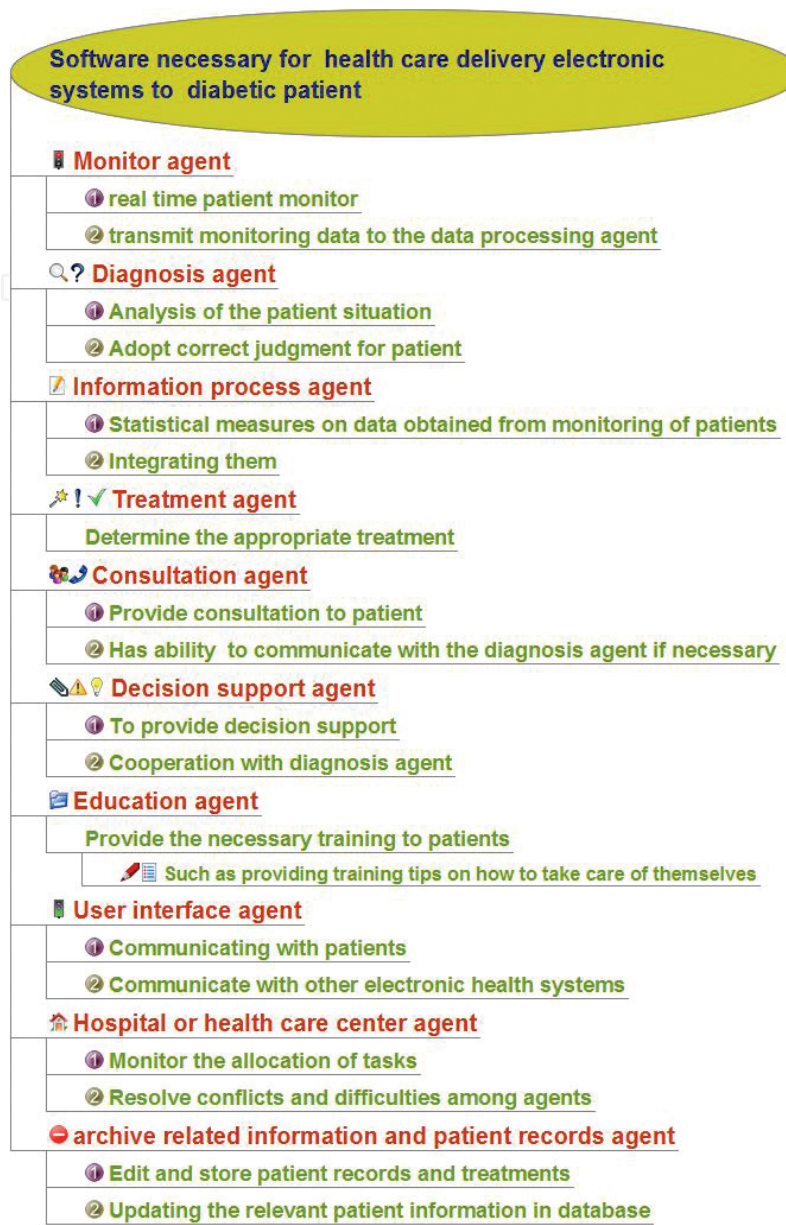
Figure 1. Software necessary for health care delivery electronic systems for diabetic patients.

Capabilities for diabetes management system based on agent technology in medical centers and hospitals section based on research findings with FREE PLANE software are depicted in Figure 2.