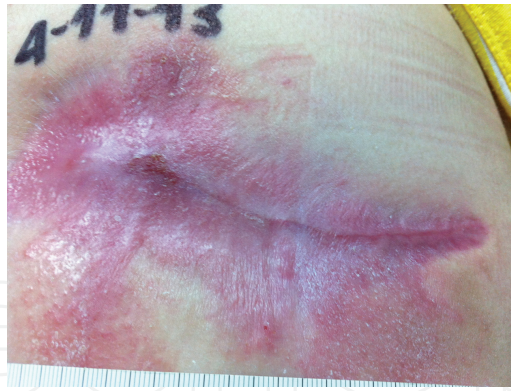
Figure 6. Complex and traumatic soft-tissue wound. Complete epithelialization after amniotic membrane treatment.