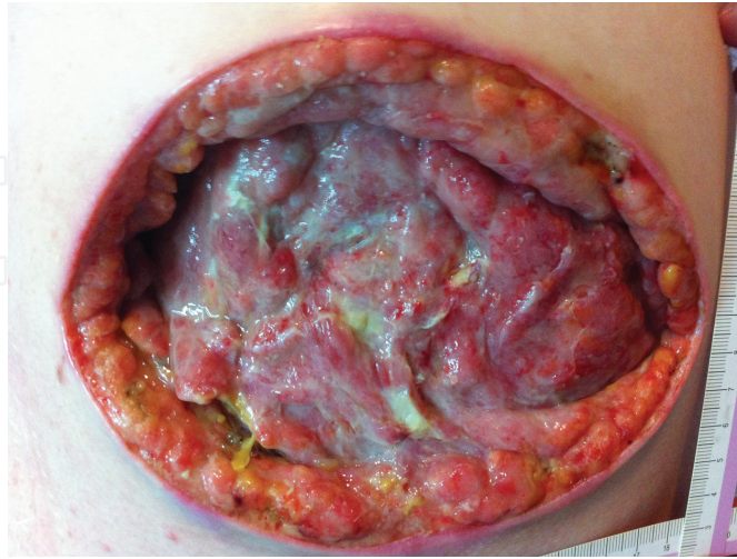
Figure 1. Complex and traumatic soft-tissue wound. Management and treatment of wound bed.

involves the overall strategies that can be applied to the management of different kinds of wound with the aim of maximizing the ability to heal wounds [16–18] ( Figure 1 ).