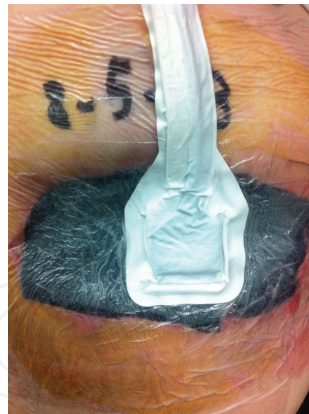
Figure 2. Complex and traumatic soft-tissue wound. Treatment with TNP therapy.