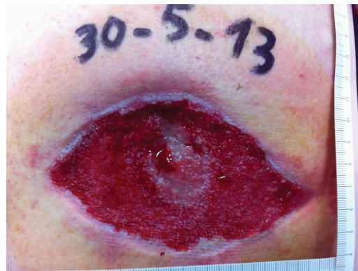
Figure 3. Complex and traumatic soft-tissue wound. Completed granulation after TNP therapy.