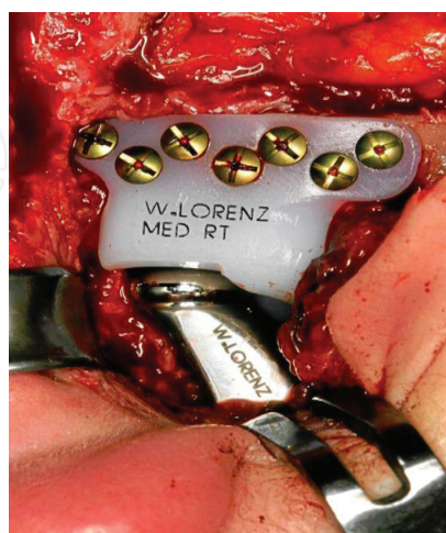
Figure 2. Installed stock prosthesis W. Lorenz. The metallic component of condylar articulating against PUAPM pit fixed with titanium screws is observed [21].

The latest inventory prostheses (W. Lorenz™) used nowadays have two components: a condylar composed of cobalt-chromium-molybdenum alloy (Cr-Co-Mo) and titanium alloy coating (Ti-6Al-4V), and a component of the composite cavity of ultra-high molecular weight polyethylene (PUAPM) ( Figure 2 ). It also presents evidence of fixtures, with the compound condyle Aluminum and Radel™ plastic tank. Both components are available in various sizes as well as in specific designs for the right and left sides, being fixed to bone by titanium screws [9–21].