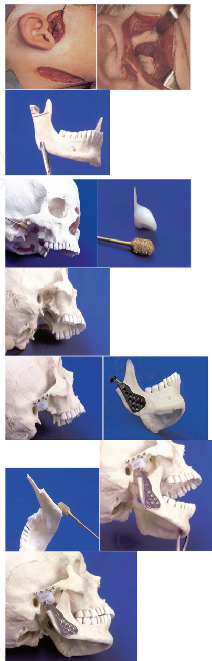
Figure 3. Scheme of surgery and placement of the prosthesis W. Lorenz [9, 10].

The surgical technique for this type of procedure follows the sequence described [25]: