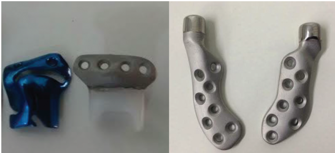
Figure 4. Customized cutting guide; fossa component; mandibular component.