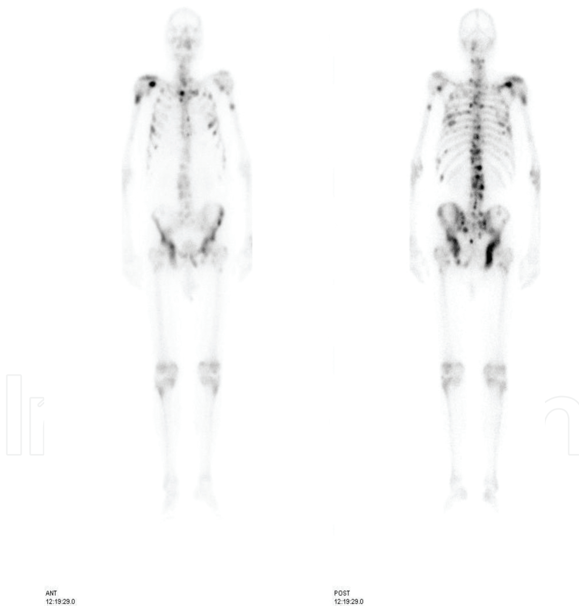
Figure 1. A bone scintigraphy that was obtained before the 153 Sm-EDTMP treatment.