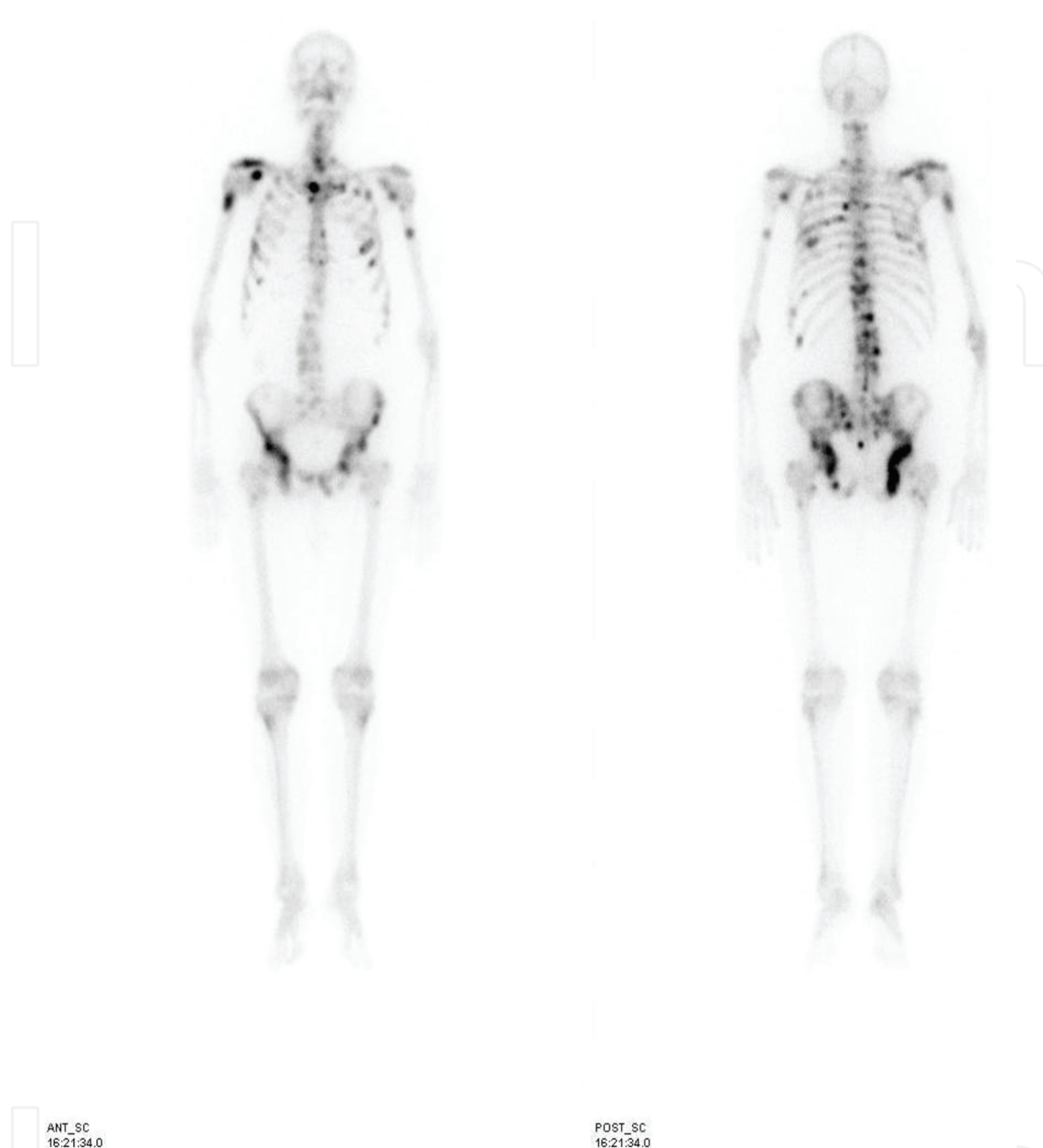
Figure 2. A bone scintigraphy that was obtained after the ^{153}\text{Sm} -EDTMP treatment.

This treatment can be repeated several times to the patients. Repeat dosing with ^{153}\text{Sm} is both safe and effective. The studied reports showed that the patients with symptomatic bone metastases receiving multiple doses of ^{153}\text{Sm} have no significant differences in pain reduction or in myelosuppression after a second or third treatment [17].