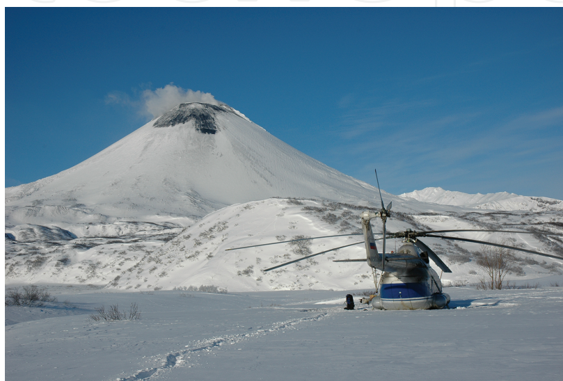
Figure 2. Summit activity on the Karymsky strato-volcano in Kamchatka [Photo by Dmitry Melnikov, Institute of volcanology and seismology FEB RAS, Petropavlovsk-Kamchatsky, Russia].

inside a volcano and hence use collected in situ or near real-time data to estimate volcanic alert status in active volcanoes [24–29]. Gravimetry studies also been used to detect various volcanic structures such as maar-diatreme volcanoes and establish the geological origin of sediment field terrestrial basins, which indeed not as simple process as we might think [30–33]. Similarly, gravimetry has been applied successfully to describe the internal architecture of large volcanoes [34] as well as relatively small-scale features as cavities in lava flows [35]. This chapter provides an easy to understand review of the science behind gravimetry studies then provides an evaluation for the future of gravimetry research on volcanoes.