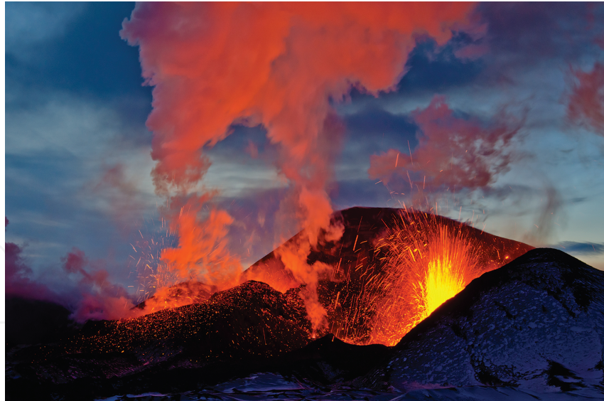
Figure 1. Strombolian style explosive eruption through a fissure vent at the Tolbachik volcano in Kamchatka (2012).

Linked to the previous chapter, the third chapter provides a critical review with some original data and research about the role of volcano gravimetry. Volcano gravimetry has developed dramatically in recent years and became a fundamental tool to understand activity changes