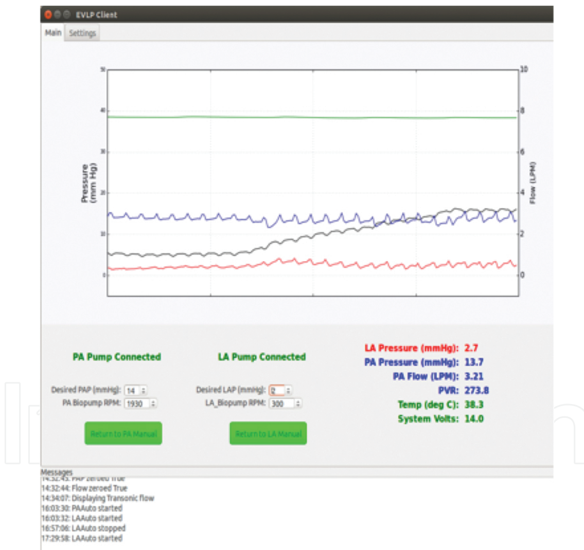
Figure 4. Microcontroller interface for the EVLP circuit parameters.

Unlike the EVLP circuit utilized at the University of Alberta, the Toronto group using the XPS™ (XVIVO Perfusion AB) and the OCS™ Lung (TransMedics) are not fully automated. Our circuit is capable of controlling and manipulating the flow, pulmonary arterial (PA) and left atrial (LA) pressures, in real time without the need for manual alterations. Our software-driven microcontroller ( Figure 4 ) receives PA/LA pressures and flow in real time, while adjusting the centrifugal pumps' RPMs accordingly to maintain desired constant PA flow/pressure control (user-selectable) and constant LA pressure. This is unlike that in the OCS™ Lung (TransMedics), where the desired flow would need to be manually changed by an attendee, or that in the XPS™ (XVIVO Perfusion AB), where the LA pressures are manually altered by the use of gravity (adjusting the height of the reservoir).