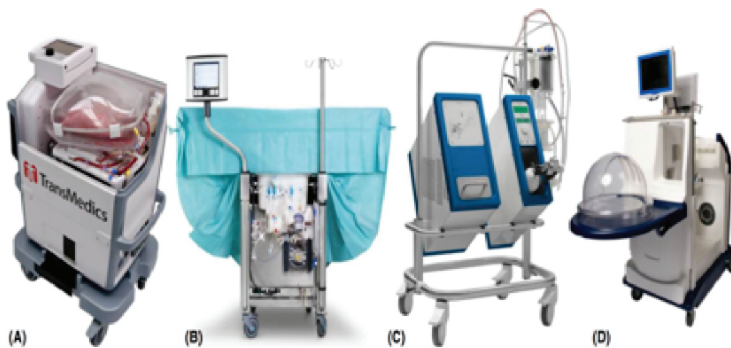
Figure 2. Commercially available ex-vivo lung perfusion devices. (A) OCS™ Lung (TransMedics); source: www.transmedics.com . (B) Vivoline LS1 (Vivoline Medical); source: www.vivoline.se . (C) Lung Assist (Organ Assist); source: www.organ-assist.nl . (D) XPS™ (XVIVO Perfusion AB); source: www.xvivoperfusion.com [37].

Figure 2 provides a visual representation of the four commercially available devices previously mentioned.