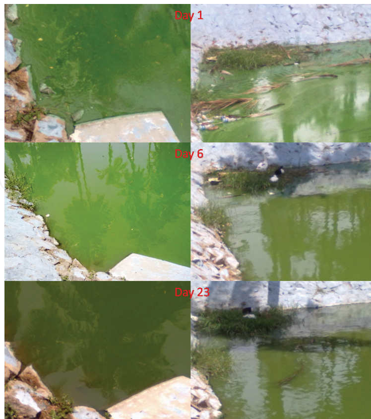
Figure 3. Visible change in water colour and BGA layer during treatment with Nualgi.