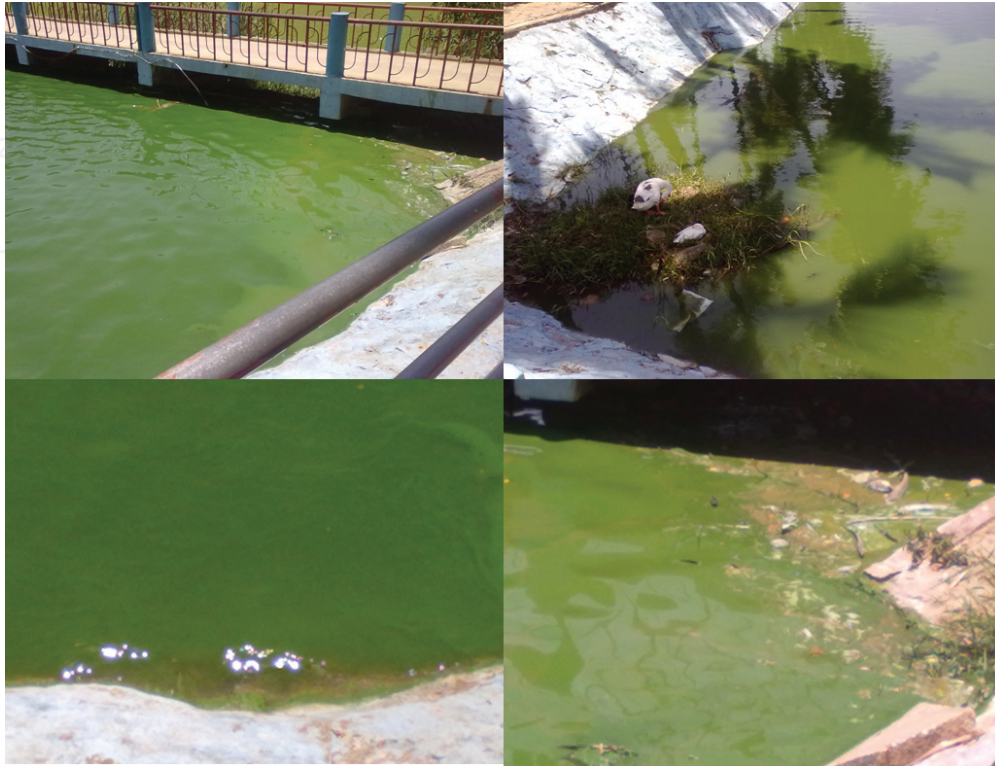
Figure 2. Lake condition before treatment at different locations.

concentration of 35.44 and 1.45 mg/l, respectively COD and BOD were also high at 323 and 64 mg/l, respectively.