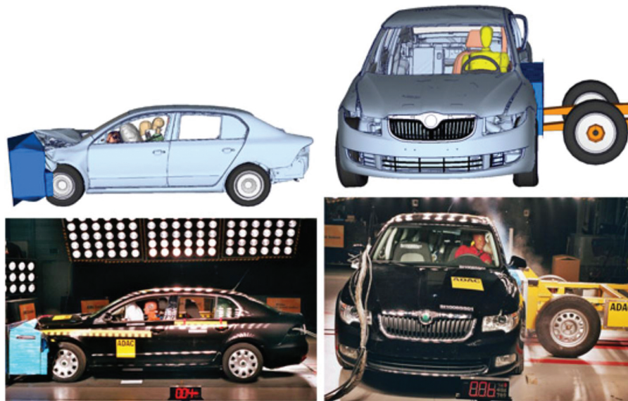
Figure 7. The vehicle crash test and simulation.

When the simulation is processed, the finite element model is ready for the post-processing. The most considerable issue for the impact is absorb or get rid of the shock energy by different methods like geometrical change of the structure, material selection, and application. The second problem is the large deformation of the structural components. Additionally, changing the parameters of the simulation model will affect the results widely depending on the experience of the analyst. Because of dealing with the highly plastic problems and non-linearity during collisions, the analyst needs to possess deep knowledge about nonlinear finite element analysis for continuum mechanics [20–22]. It should be stated that the analyst can be faced with the geometrically nonlinear problems or material nonlinearities which is imported to be expressed.