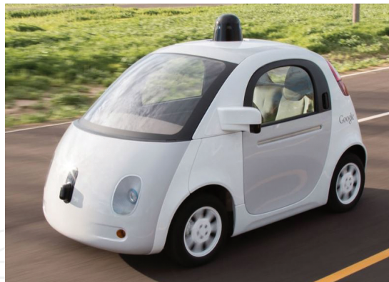
Figure 3. Google self-driving car.

The technological improvements in numerous dissimilar segments are effecting the UAV technology too, like media and entertainment. With the help of the lately used drones are easily operated, simple and cheap widely used by the professionals likewise amateurs in various applications. This option introduces some hazardous results with the ease of the system. Although the price of the simple applications like drones less when it is compared with the complex vehicles, consequences could be analogous.