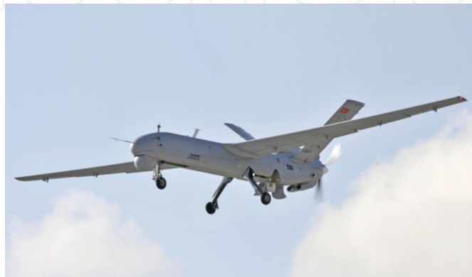
Figure 2. Medium Altitude Long Endurance (MALE) UAV of Turkish Aerospace Industries, Inc.

zones and decrease the threats by the enemies or the terrorists. An unmanned aerial vehicle (UAV) shown in Figure 2 in Ref. [13], widely used as a drone, or an unmanned aircraft system (UAS), and also referred by several other names, defines an aircraft without a human pilot. Therefore, an aircraft without a pilot means, alive human, but in the right hands yet, this sophisticated technology will be so perilous against innocents. And also, the more professionally UAS requires the more trained and talented personnel in particular formidable and arduous duties. This can possibly cause unexpected mistakes during the tasks that provoke impacts and collisions.