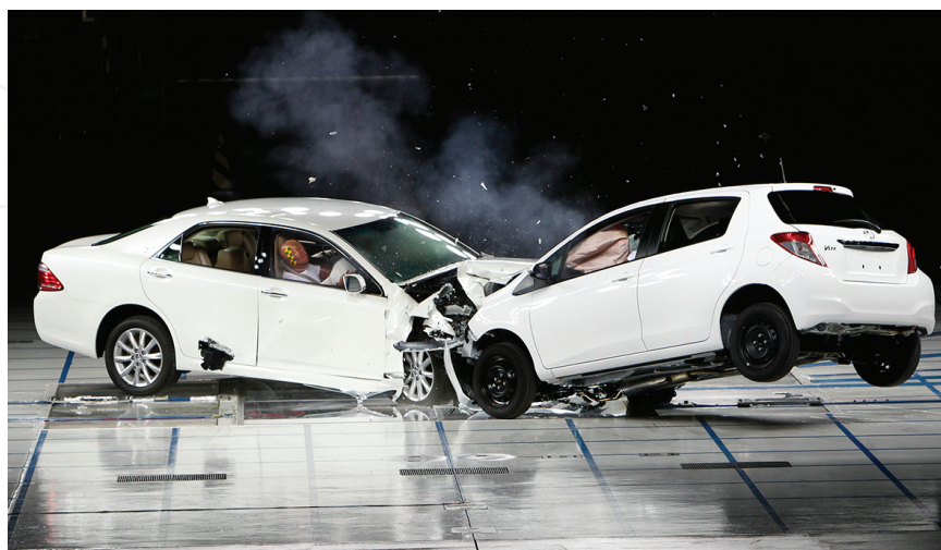
Figure 6. Vehicle-to-vehicle impact test of Toyota Motor Company.

The tests can be classified in three categories: component tests, sled tests, and full-scale barrier impacts. Because of the complexity and many distinct test variables in full-scale tests, there is an acceptable reason in the reduction of the test's repeatability. The impact test depicted in (Figure 6) is representing a full-scale vehicle-to-vehicle impact test of Toyota Motor Company while they are developing a new safety system for their automobiles [18]. The dynamic and/or quasi-static response of an isolated component is defined by the component tests are exalted to detect the crush mode and energy absorbing ability. With the help of the component tests, it also gives the capability to the designers to develop prototype substructures and mathematical models. Moreover, the vehicle rear structure full-scale tests are governed either via a deformable barrier or a bullet car to state the integrity of the fuel tank. To evaluate roof strength according to FMVSS 216, a quasi-static load is applied on the "greenhouse," and providing that the roof deformation falls below a particular level for the applied load [6].