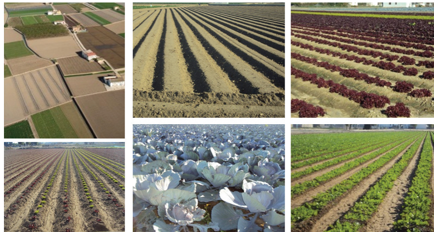
Figure 2. Spatial structure and composition.

There are a lot of very small size plots. Table 4 , indicates that there are around 22.000 farms. From these, 60% are short farms, smaller than 10 ha. 25% between 4 and 10 Ha.