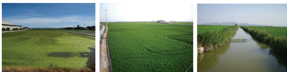
Figure 3. Paddy fiels area in Albufera Park.

In the area of Huerta, we find sites hosting natural diversity of habitats subject to different forms of protection. South of the Huerta de Valencia is the Albufera Natural Park. Paddy field area is located within the Albufera Park.