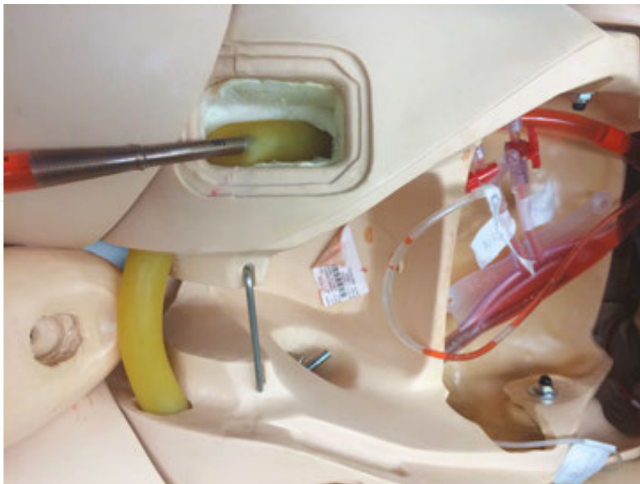
Figure 2. Modification of old manikin—inserting an ECMO cannula into the pretended vessel.