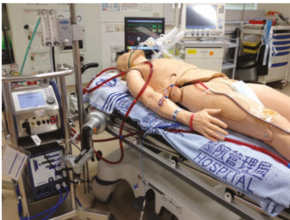
Figure 4. High-fidelity simulation environment for the ECMO simulation training.