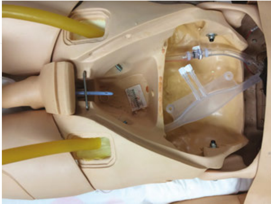
Figure 1. Modification of old manikin—forming a closed loop with a “bladder” reservoir and using a latex tube to pretend central vein.

scenario of hypovolaemia, we would draw “blood” from the circuit with the syringe. In scenario of air embolism, we would inject “air” from the syringe into the circuit ( Figures 1–3 ).