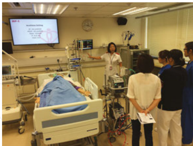
Figure 5. Instructor is briefing participants the simulation environment.

The participants are brought into the simulation rooms. The group instructors orientate the participants the simulation environment inside the simulation room. Instructors explain what can the simulator do, and what are the limitations of the simulator, what equipment is available, where is the physiological monitor and what parameters will be shown. Participants are told that they can manage the ECMO circuit and adjust the parameter freely according to their clinical judgement and decision. One of the instructors will serve as a confederate in the scenario to facilitate scenario flow.