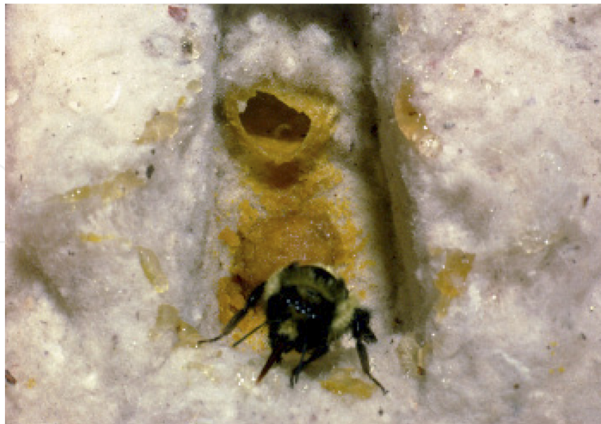
Figure 2. A queen with her first brood clump and a well constructed honey pot. Note also the honey squirted by the queen on the cotton.