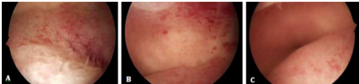
Figure 1. Hysteroscopic view of chronic endometritis in a 30-year-old infertile woman. Saline used as distension medium does not affect endometrial microcirculation, making it easier to identify the characteristic signs of chronic endometritis. Note the micropolyps, which appear as small pedunculated, vascularized protrusions (<1 mm) on the uterine mucosa (A). The close-up view clearly shows a marked accentuation of the vascular network at the level of the uterine fundus (B). To right, an overt stromal edema is evident (C), though the examination was carried out in the early proliferative phase.