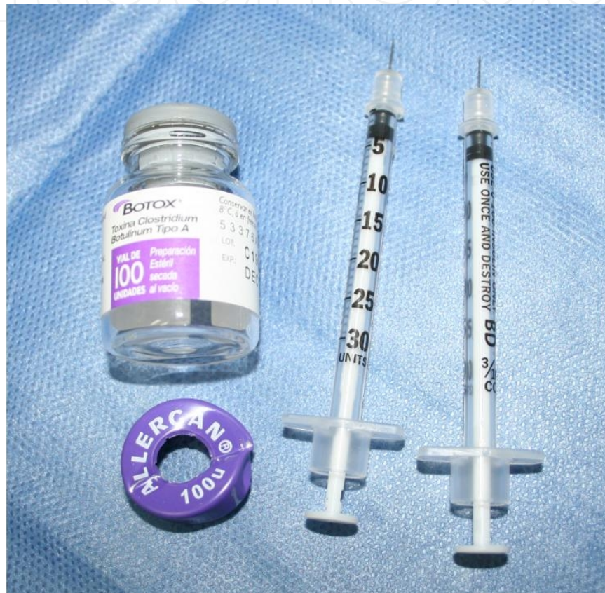
Figure 1. Commercial presentation of Botox®. Syringes used for application.

Since 1987, Botulinum toxin type A has been used to enhance the aesthetic appearance of the upper third of the face (Fig. 1). The main effect is softening of dynamic wrinkles by diminishing mimic muscles contraction. Nowadays, the cosmetic use of Botulinum toxin is no longer limited to this area and has extended to the inferior third of face, neck, and the medial facial area and to the nose, which is the main subject of this book.