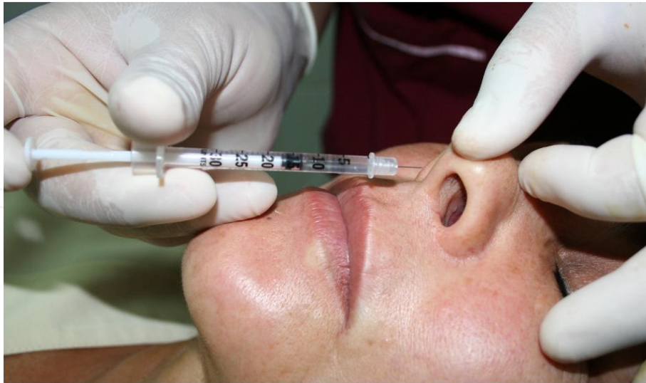
Figure 4. Application in the depressor septi nasi.

Peres Atamoros [14] created a therapeutic protocol that allows measuring of the tip elevation when using BOTOX®. He establishes that for a soft elevation, 2 UI must be injected in each dilator naris and 2 UI in the depressor septi nasi (total of 6 UI). For a medium elevation, 4 UI should be injected in each point (total of 12 UI). Finally, for a strong elevation 6 UI should be injected in each point (total of 18 UI).