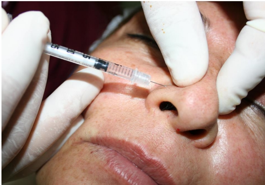
Figure 5. Application in the levator labii superioris alaeque nasi.

The side of the columella and the septum turns visible when the nostrils open exaggeratedly. This unaesthetic appearance gets accentuated with the contraction of the depressor septi nasi . In people with wide nasal base and ability to move the nasal ala, a stretching effect is seen in nostrils after applying BOTOX® in the dilator naris posterior . The injection of 5–10 UI, bilaterally, in the area of greater contraction of the dilator naris posterior (over the nasal ala), has diminished the nasal flutter for 3–4 months (Fig. 5). We have not experienced secondary effects after the use of toxin in this area.