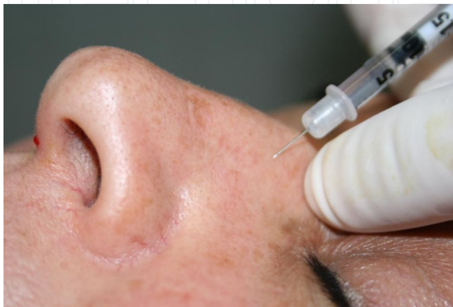
Figure 7. Application in nasal dorsum for hyperhidrosis pseudo-blackhead.

cystic lesions of elevated surface with a blue coloration that is seen through a transparent dome, easily confused with blackheads. It is common to find them in the facial area surrounding the eyes, forehead, nose, and superior lip. The etiology is a defect in transpiration or insensible perspiration. If ruptured or spontaneously broken, a clear and transparent liquid drains. It is presented in literature as an infrequent disease, but we think that is because of ignorance and misdiagnose with blackhead. This condition worsens with transpiration and environmental humidity, thus enlarging in summer and reducing in winter.