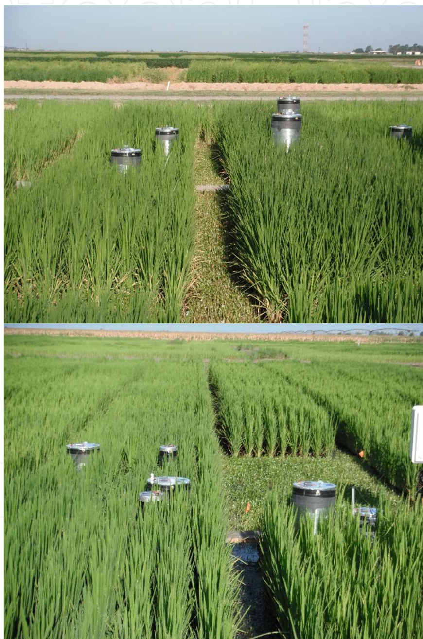
Figure 1. Chamber-based measurements of methane emissions from small plots at the Rice Research and Extension Center near Stuttgart, AR (top), and at the Northeast Research and Extension Center at Keiser, AR (bottom).

of microorganisms are adapted to different environmental conditions, and, as a result, are affected differently based on the structure and conditions of an ecosystem, which results in variability of \text{CH}_4 production and oxidation potentials across time and space [54]. With low \text{CH}_4 production rates or long diffusion pathways, it seems that the majority of the \text{CH}_4 produced is oxidized. Conversely, in cases where \text{CH}_4 production rates are high or diffusion paths are short, less \text{CH}_4 is oxidized and a greater portion reaches the atmosphere [54] (Figure 1).