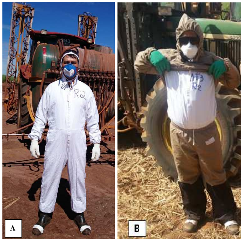
Figure 2. Workers applying pesticide in the field during assessment of potential dermal exposure: A—quantified in coverall and unprotected, exposure real: B—quantified in coverall worn under the personal protective equipment during the evaluation period, according VBC 82.1 [36].