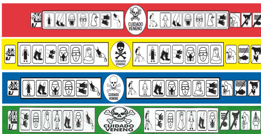
Figure 3. Warning band required at the bottom of the label, colored according to the toxicological class and pictograms about environmental and worker safety.

The label central column shall contain the manufacturing and expiration dates, indications whether the content is explosive, flammable, oxidizing, corrosive, irritant, or subject to applied sales. The following warnings should also be on the label: "The use of personal protective equipment is required. Protect yourself" and "The return of the empty package is required," along with the toxicological and potential environmental hazard classification.