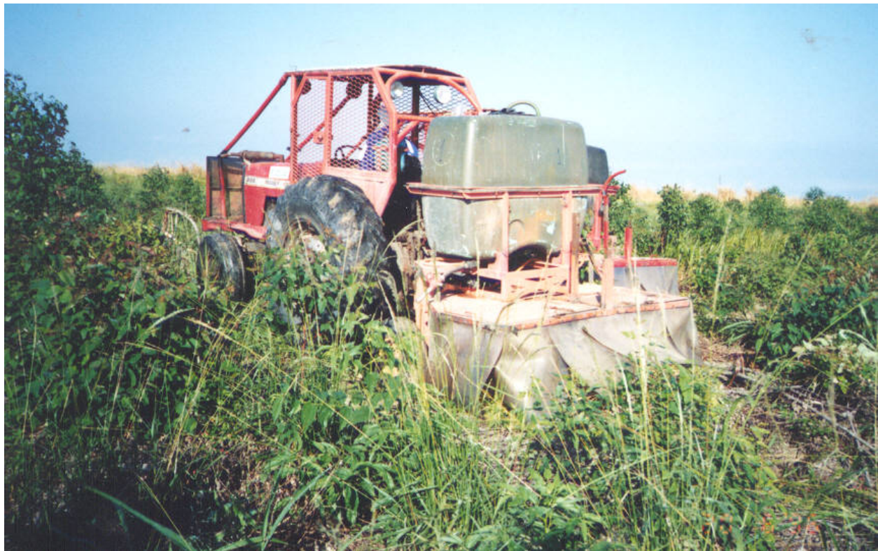
Figure 4. Sprayer bar protected with plastic blades attached to the bar used to apply nonselective herbicide between plant rows in eucalyptus plantation areas [24].

The total exposure of the tractor driver without individual protection, but with protected spray bar, was 838.88 mg/day of glyphosate and MOS of 8.62 [24]. Therefore, the protection of the spray bar made the tractor driver work safe, with acceptable poisoning risk and tolerable exposure levels.