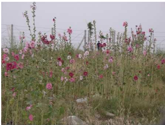
The first autumn in the study area