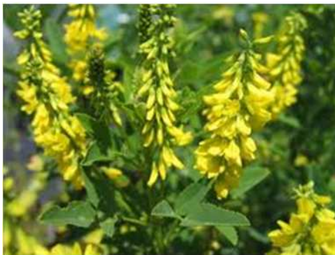
M. officinalis flower (yellow melilot)(Original)