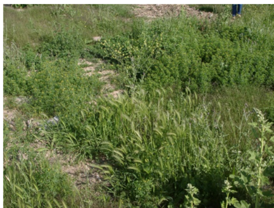
Lolium temulentum in the plot