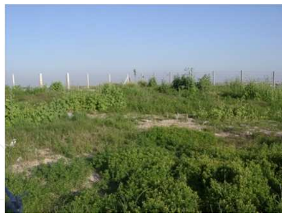
The second spring in the study area