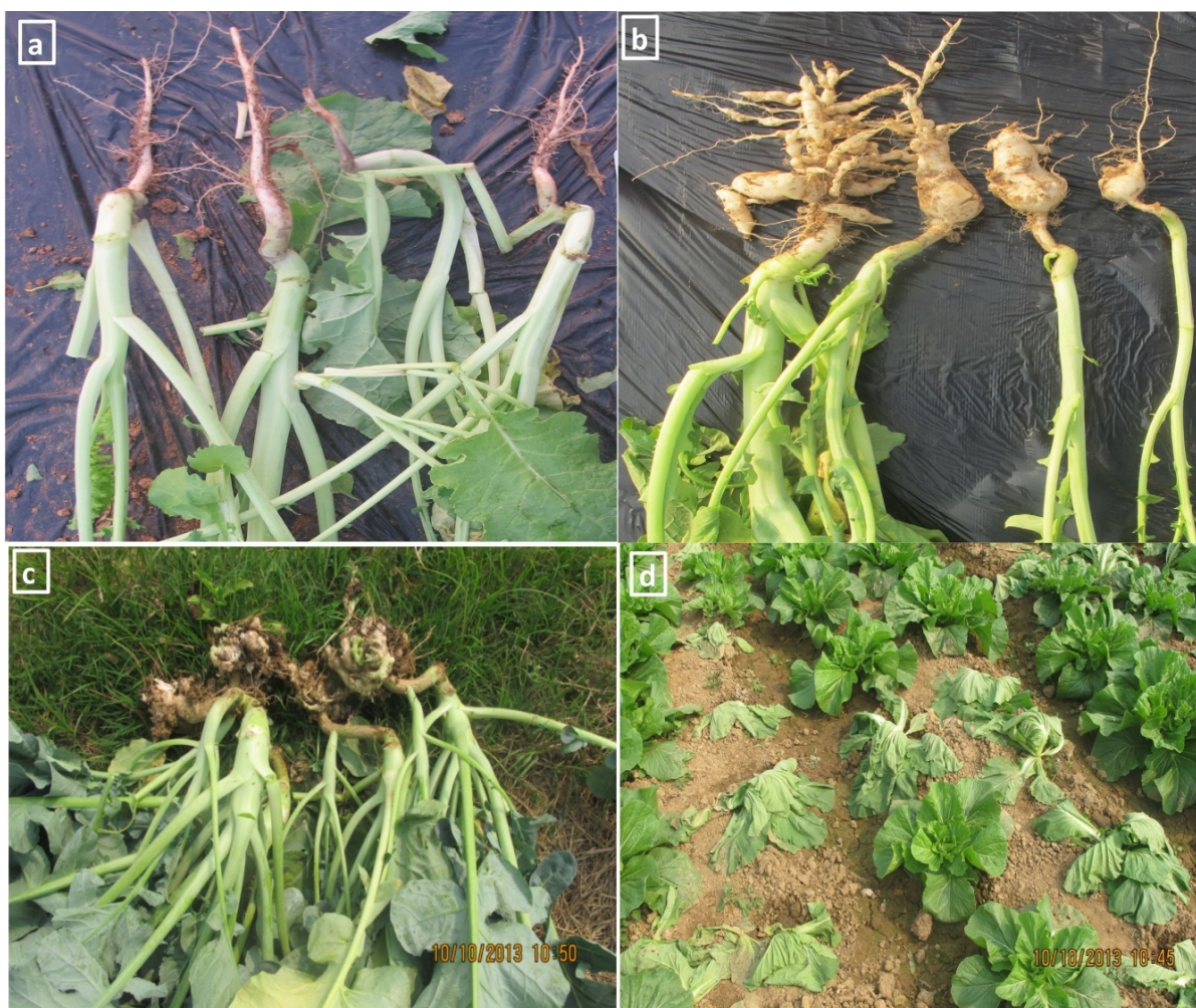
Figure 2. Clubroot disease symptoms in highly infected fields. (a) Clubroot-resistant breeding line of B. rapa showed no clubroot symptoms on roots, (b) clubroot disease symptoms with large galls on primary and secondary roots in turnip rape line of B. rapa under field conditions, (c) clubroot galls on roots of broccoli in B. oleracea , and (d) highly infected field of Chinese cabbage in Henan province of China.