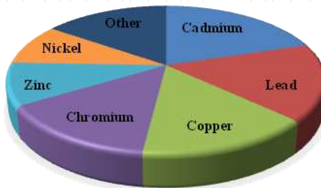
Figure 2. Metals used in bioremediation process employing microorganisms.

Figure 2 gives some indication of which metals are used in bioremediation processes employing microorganisms, and chromium, copper, cadmium, and lead together account for 70% of applications, although nickel and zinc are also used. Other metals that are used to a lesser extent include arsenic and mercury.