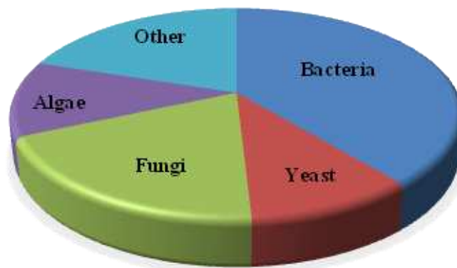
Figure 1. Types of microorganisms used in bioremediation processes.

The number of publications on the use of microorganisms for the removal of heavy metals in contaminated environments has been increasing steadily over the past 10 years. Figure 1 shows the main types of microorganisms used in these processes, based on a search for papers reporting microorganisms and bioremediation studies, indexed in the ISI Web of Science for the period of 2004 to 2014. It can be observed in Figure 1 that the microorganisms that have been most commonly used are bacteria and fungi, although yeast and algae are also frequently applied.