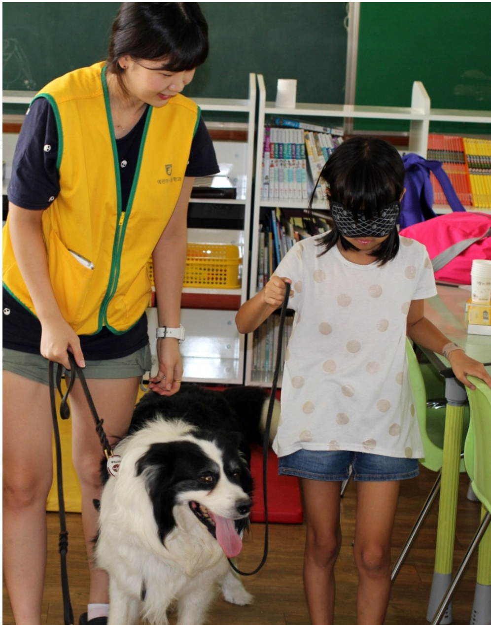
Figure 5. Animal-assisted therapy program for children with depression

well-being. This includes men, women, and children of all ages who have had pertinent precautions and safety issues addressed. Specific medical indications include but are not limited to autism, dementia, chronic diseases, mental disorders, and neurological disorders including aphasia and epilepsy [19–24].