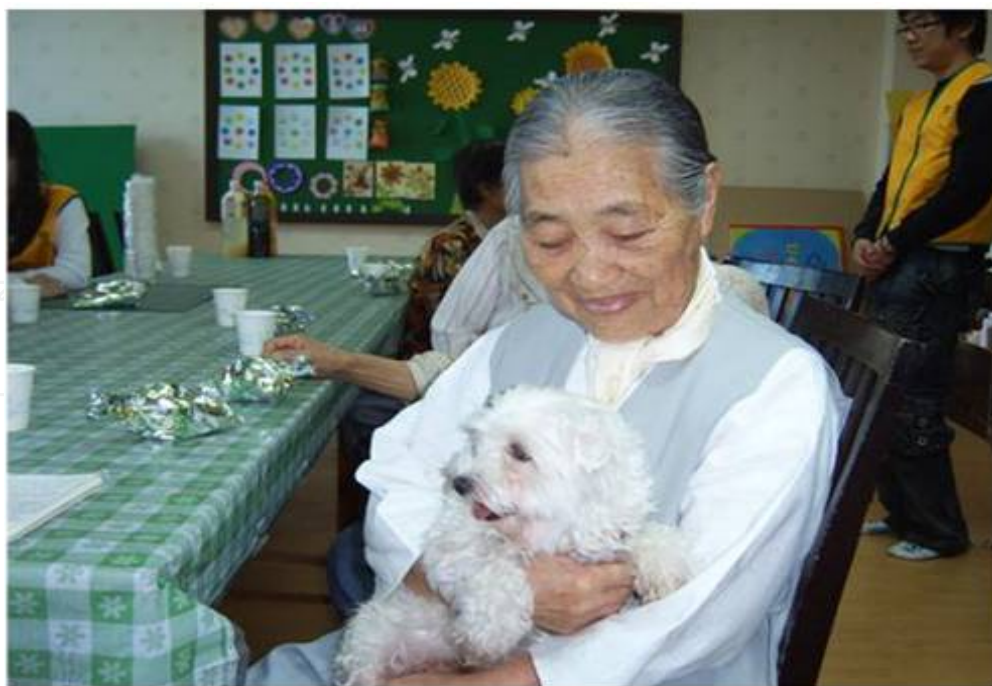
Figure 4. Animal-assisted therapy program for the elderly with dementia

cated animals to respond affectionately to human attentions and to elicit pro-social behavior and positive effect may serve as an emotional bridge to mediate interactions in therapeutic contexts [14].