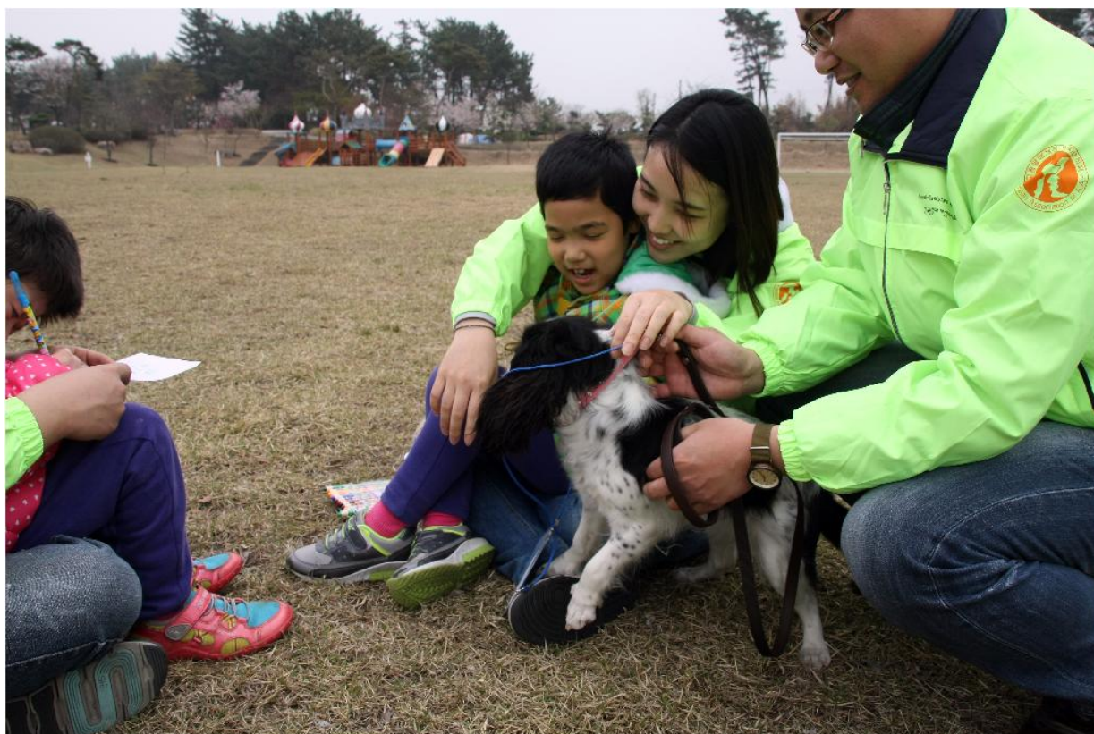
Figure 2. Animal-assisted therapy program for the children with autism

Figure 2 shows an animal-assisted therapy program for the children with autism in Korea. We summarized the benefits of animal-assisted interventions in Figure 3.