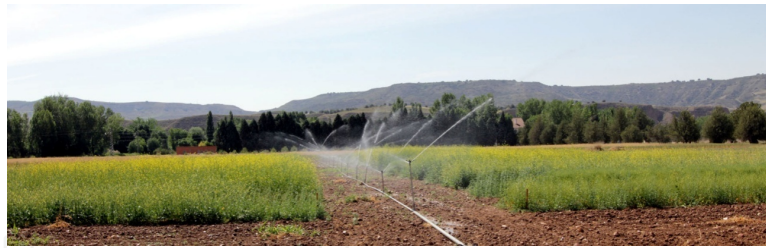
Figure 1. Cultivar trials in the experimental farm “La Canaleja”