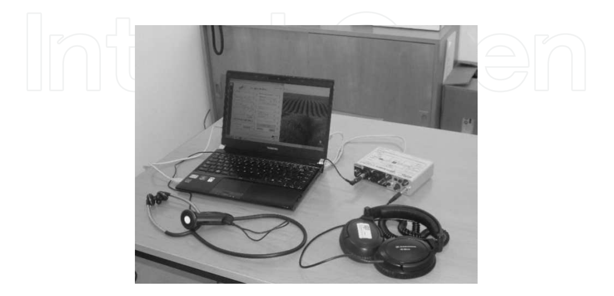
Figure 1. Single-channel equipment for computerised respiratory sound analysis.

To assess computerised respiratory sounds, the patient is positioned in the sitting or supine position (for long-term assessments) and instructed to breath from his/her mouth. Successive or simultaneous recordings are taken from the trachea plus six chest locations (i.e., right and left: anterior, lateral and posterior positions), using a single or a multichannel equipment (Figures 1 and 2) [94].