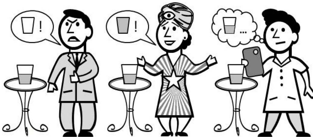
Figure 2. Representation of the two poles of ignorance (the obstinate skepticism and the naive mysticism), and the balanced position

The famous British physicist and cosmologist Stephen Hawking stated: the greatest enemy of knowledge is not ignorance; it is the illusion of knowledge. A conservative scientific position employs observation, empirical investigation, and theoretical explanation of each phenomenon. Figure 2 represents what we call here the two poles of ignorance and the balanced position related to the discussion of DH. The first pole is the obstinate skepticism (arrogant and prejudiced attachment to materialism), that denies the full half. The opposite pole is the naive mysticism (unrealistic trust on paranormal potentialities), that denies the empty half. The balanced position is the option for the enlightened scientificism, a non-dogmatic, open-minded method of acquiring knowledge about nature.