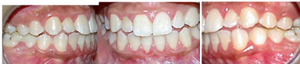
Figure 6: Initial malocclusion in therapeutic position.

This is the case of a 21-year-old patient who had a disc displacement on the left side (fig6, 7, 8).. He was referred to the clinic by his occlusodontist to sustain mandibular position after repositioning occlusal resin splints (fig9, 10).