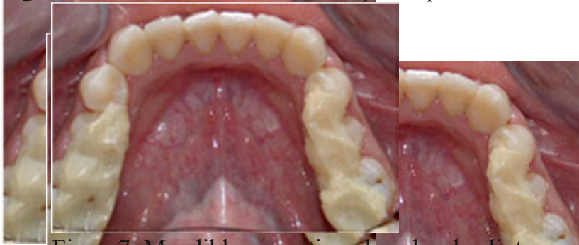
Figure 7: Mandible repositioned occlusal splints.