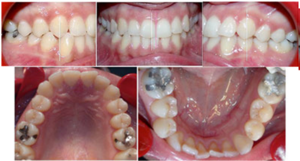
Figure 1: Occlusion at the start of treatment. Occlusion is in CII molar and canine on the right side and the left CIII.

This is the case of a young adult aged 20 with inter-incisive deviation (fig1). After the diagnosis of functional origin, manipulation of centric relation showed interarch horizontal changes (fig2). Indeed, the mandible refocuses with the appearance of a right angle and left compared to the class III Angle occlusion. In this case, it is clear that the choice of the mandibular reference will be irrevocably on the centric relation position(fig2). Orthodontic treatment stabilizes the occlusion in the corrected mandibular position(fig3).