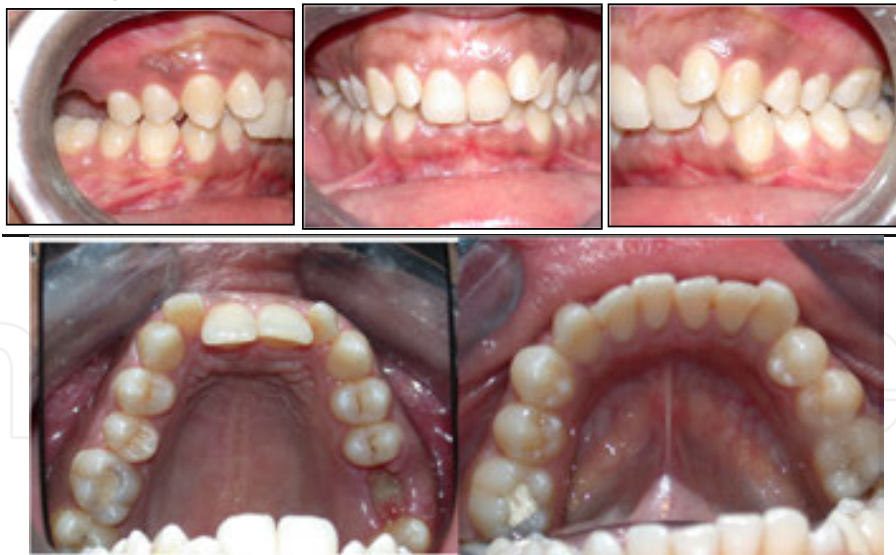
Figure 4: Initial malocclusion in intercuspal occlusal position.

This is the case of a patient, aged 26, who came to the clinic for purely aesthetic reasons related to his malocclusion of Class II div 1 (fig4). Clinical examination revealed a fully functional intercuspal occlusal position used as a reference throughout treatment (fig5).