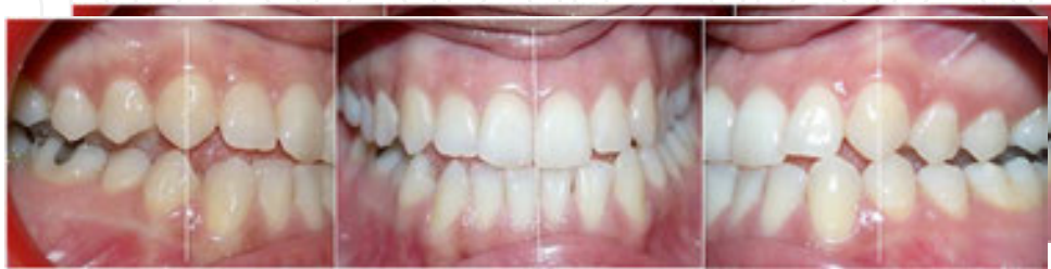
Figure 2: Centric relation position: CIII canine and molar on the right and left side.

The IOP will only be used if it dictates the mandibular position by a maximum of stabilizing and harmoniously spreading contacts in a position close to centric relation without transversal differential (case 2).