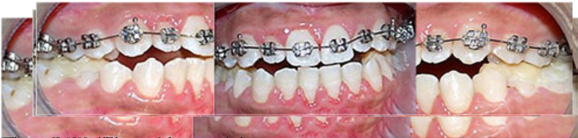
Figure 8: Maxillary arch preparation.