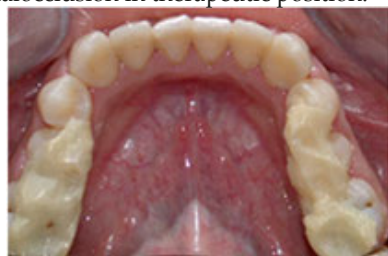
Figure 7: Mandible repositioned occlusal splints.