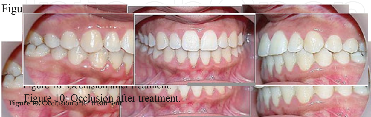
Figure 10: Occlusion after treatment.