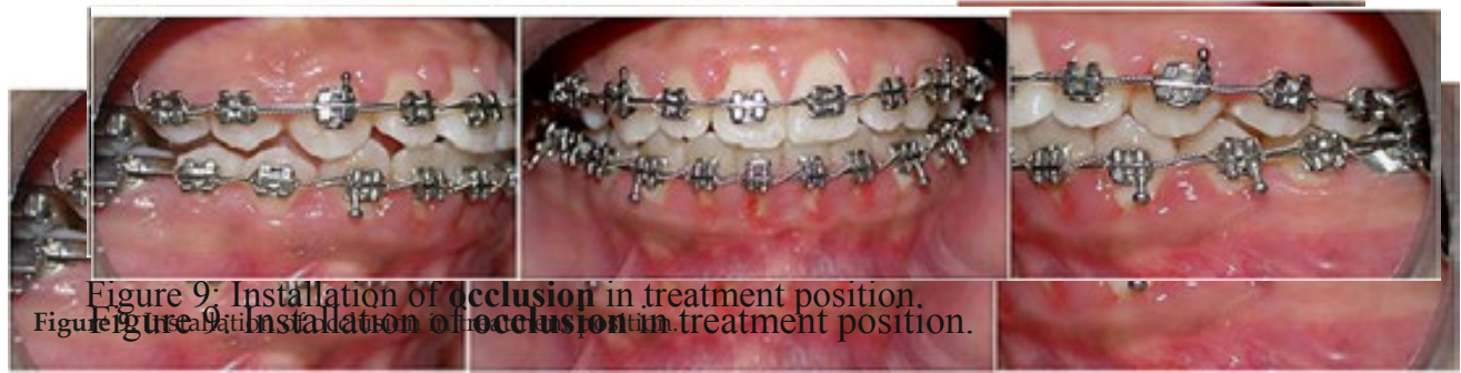
Figure 9: Installation of occlusion in treatment position.