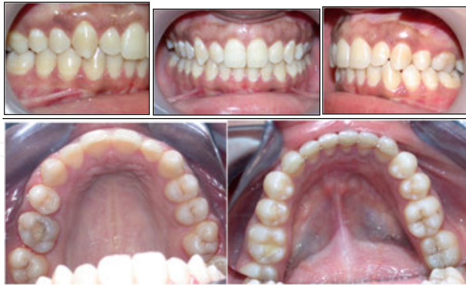
Figure 5: Occlusion treatment.