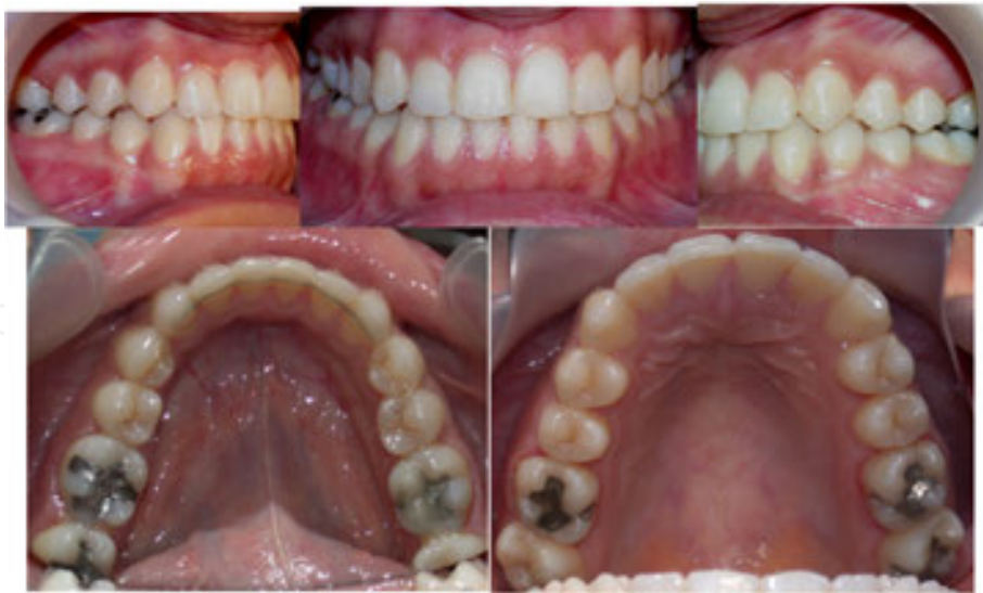
Figure 3: Installation of occlusion in centric relation position.

The IOF will only be used if it dictates the mandibular position by a maximum of stabilizing and harmoniously spreading contacts in a position close to centric relation without transversal differential (case 2).