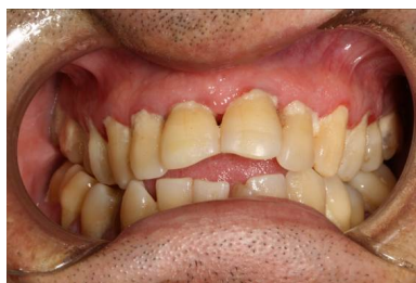
Figure 25. Accumulation of plaque due to poor hygiene during RTP.