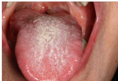
Figure 7. Candidiasis during RTP.