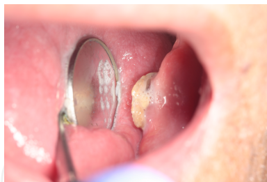
Figure 19. ORN after four months of finishing the RTP. Extraction had been carried out pre-RTP.

One third of ORN cases are spontaneous, although most cases occur due to teeth removal during radiotherapy or during an insufficient healing time after pre-RTP extractions. According to Starcke, Shannon, Murray and Makkonen, when the pre-RTP tooth removal is performed correctly and a certain period passes, a significant increase of osteoradionecrosis is not observed [43-45].