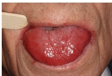
Figure 3. Grade 1.