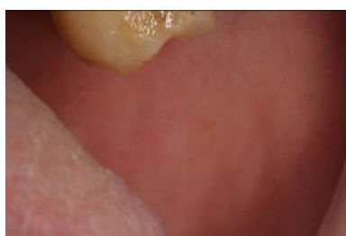
Figure 37. Left buccal mucosa.