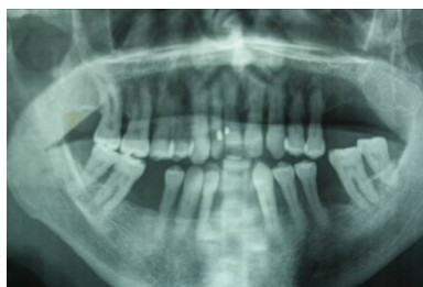
Figure 26. Before RTP.

Figure 26 and 27: Orthopantomography of a patient before beginning the RTP and two years after finishing the RTP.