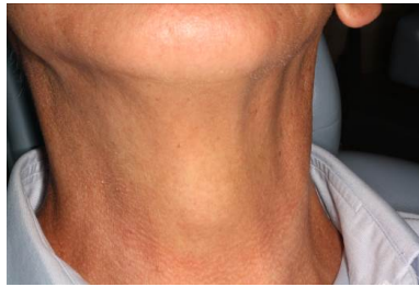
Figure 9. Radiodermatitis: Grade 0, 5 sessions of RTP.