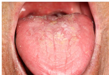
Figure 13. Rough tongue due to salivary hypofunction.