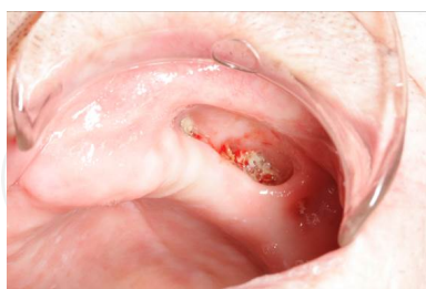
Figure 21. ORN after extraction post-RTP.

Incidence of ORN is two times higher in patients with teeth, although poor dental hygiene and continued drinking and smoking can also contribute to its quick appearance [46]. A higher incidence of osteoradionecrosis has been observed after receiving doses of over 65 Gy. This depends on the fractioning of radiation and the treatment with QTP or surgery in the irradiated area [47] (Figure 22 and 23 - case report of ORN that, after seven months of treatment, positively developed chlorhexidine.).