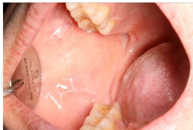
Figure 1. Grade 0.

Grade 4: Oral feeding is impossible (Figure 6).