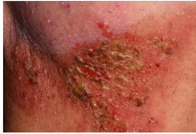
Figure 12. Radiodermatitis Grade III, 24 sessions of RTP.