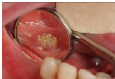
Figure 17. ORN in the jaw after extraction post-RTP.

Most ORN cases take place in the jaw. Here, vascularization is deficient and there is high bone density (Figure 17, 18 and 19). Clinical manifestations of ORN may include pain, orofacial fistulas, exposure of the necrotic bone, pathological fractures and suppuration [42].