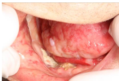
Figure 18. ORN in the jaw after extraction post-RTP.