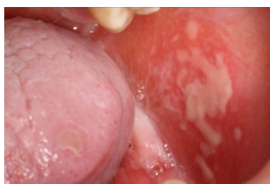
Figure 4. Grade 2.