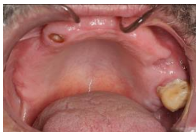
Figure 34. Top arcade.