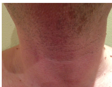
Figure 29. Neck.