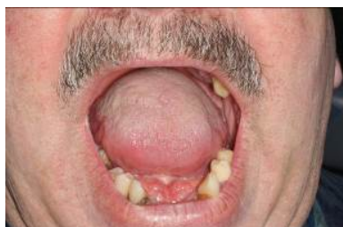
Figure 30. Maximum opening of the mouth.