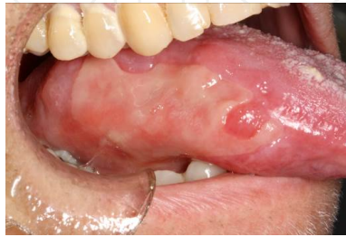
Figure 6. Grade 4.