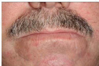
Figure 28. Mouth closed.

Figures 28-39: Radiographical series from the patient going to treatment with RTP.