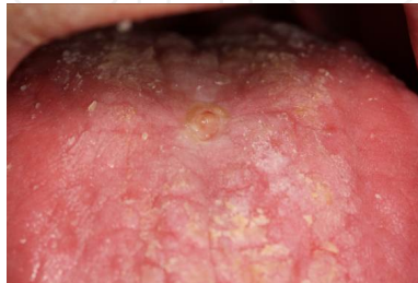
Figure 14. Necrosis of soft tissue two months after finishing RTP.