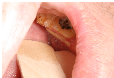
Figure 22. ORN two months after finishing the RTP, without previous extractions.