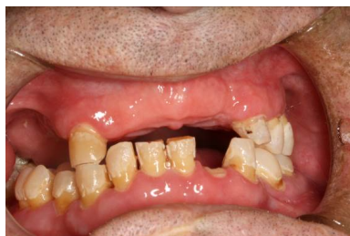
Figure 24. Dental wear during RTP.

For irradiated patients, dietary changes - a softer or liquid diet with a higher concentration of carbohydrates - combined with a decrease in saliva, results in a change in the microbiota. This becomes increasingly cariogenic. This, in addition to poor dental hygiene, results in a demineralization of the enamel and the destruction of crowns and the cervical area. Here, the cement and dentin is exposed to the oral environment, producing increased dental sensitivity [48].