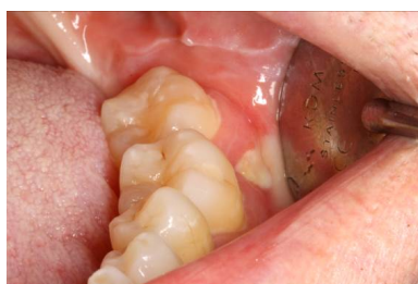
Figure 20. Spontaneous ORN in the jaw after RTP.

One third of ORN cases are spontaneous, although most cases occur due to teeth removal during radiotherapy or during an insufficient healing time after pre-RTP extractions. According to Starcke, Shannon, Murray and Makkonen, when the pre-RTP tooth removal is performed correctly and a certain period passes, a significant increase of osteoradionecrosis is not observed [43-45].