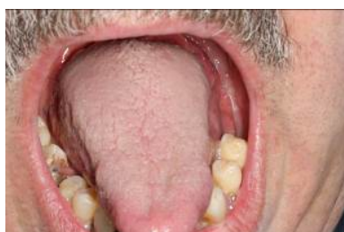
Figure 38. Tongue.