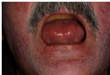
Figure 11. Radiodermatitis: Grade II, 17 sessions of RTP.