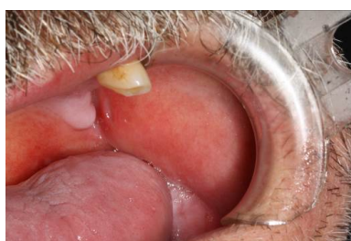
Figure 2. Grade 1.