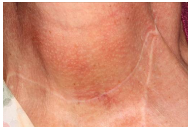
Figure 10. Radiodermatitis Grade I, 10 sessions of RTP.