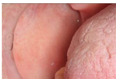
Figure 36. Right buccal mucosa.