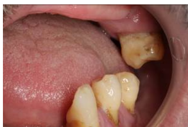
Figure 33. Left lateral intercuspitation.