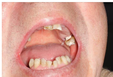
Figure 16. Still suffering from trismus one and a half years after finishing the RTP.