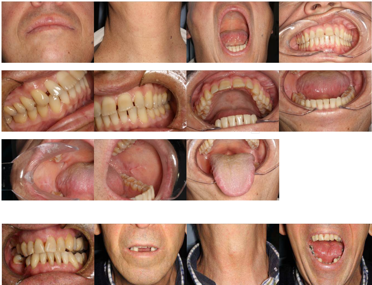
Figure 39. Before RTP