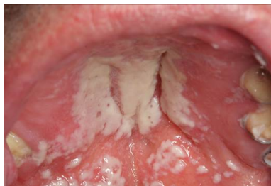
Figure 8. Candidiasis during RTP.