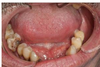
Figure 35. Lower arcade.