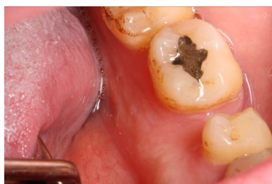
Figure 23. After seven months of good oral hygiene and rinses with chlorhexidine and chlorhexidine gel, it has progressed favourably.