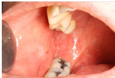
Figure 15. Necrosis of soft tissue two months after finishing RTP.