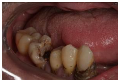
Figure 32. Right lateral intercuspitation.