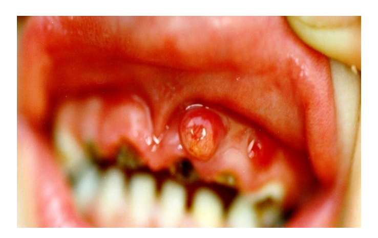
Figure 6. Abscess and fistula

Local situation – the gingiva is edematic, hyperemic and under pressure it is painful. Also while applying a slightly harder pressure from the gingival pocket purulent secret will come out. The tooth is extremely sensitive to palpation and percussion. (Fig.7)