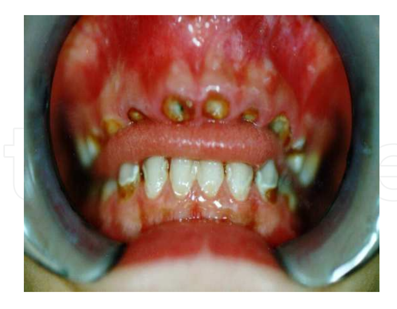
Figure 4. ECC<sub>r</sub> (radix relicta stage)—total destruction of the crown.