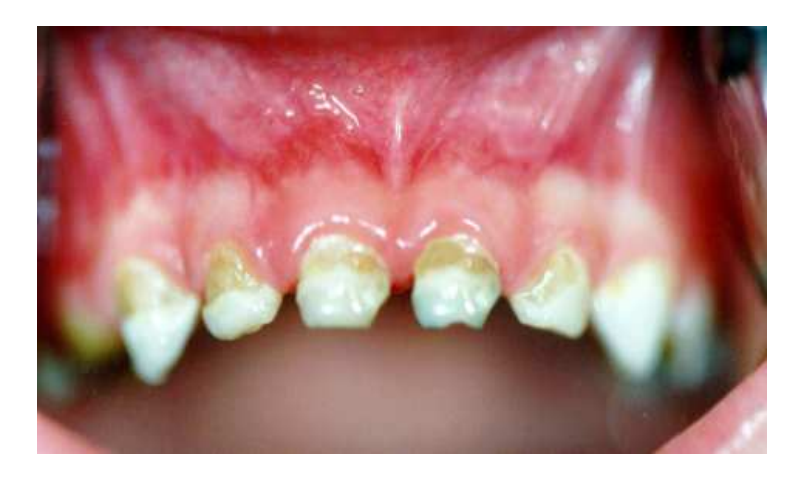
Figure 2. ECCc (circular stage)—lesion in the dentin and circular distribution of this lesion proximally.