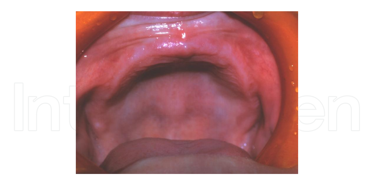
Figure 12. Total extraction of teeth-result of ECC complications

bacterium in preschool children. S mutans is found at the earliest ages, with the prevalence of 53% in 6- to 12-month-old children (Milgrom 2000), 60% in 15-month-olds (Karn 1998), 67% in 18-month-old Swedes (Hallonsten et al. 1995), and 94.7% in 3- to 4-year-old Chinese (Li et al. 1994). Almost all preschool urban Icelandic children were found to carry S mutans (Holbrook 1993). According to the studies of Ge and Caufield, all S-ECC children were S mutans–positive (Ge 2008). Borutta 2002, found that in 80% of children (3 years old) diagnosed with caries, the presence of S mutans was demonstrated, while higher counts of this bacterium were found in children with ECC.