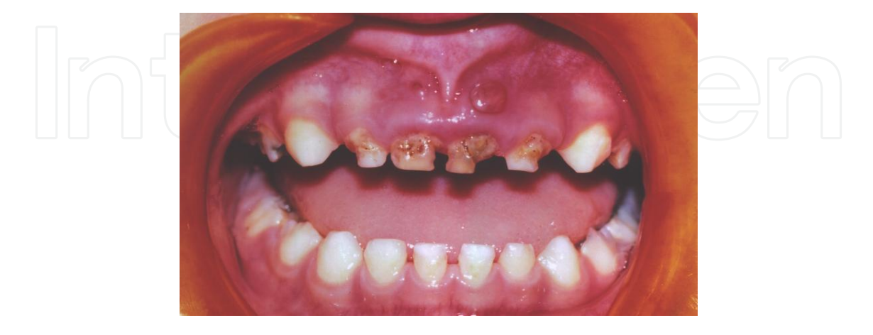
\textbf{Figure 3.} \ \, \textbf{ECC}_{d} \ \, (\text{destructive stage}) - \text{destruction of more than half the crown without affecting the incisal edge}.