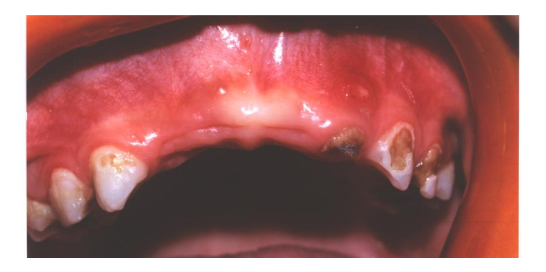
Figure 11. Early extraction of teeth