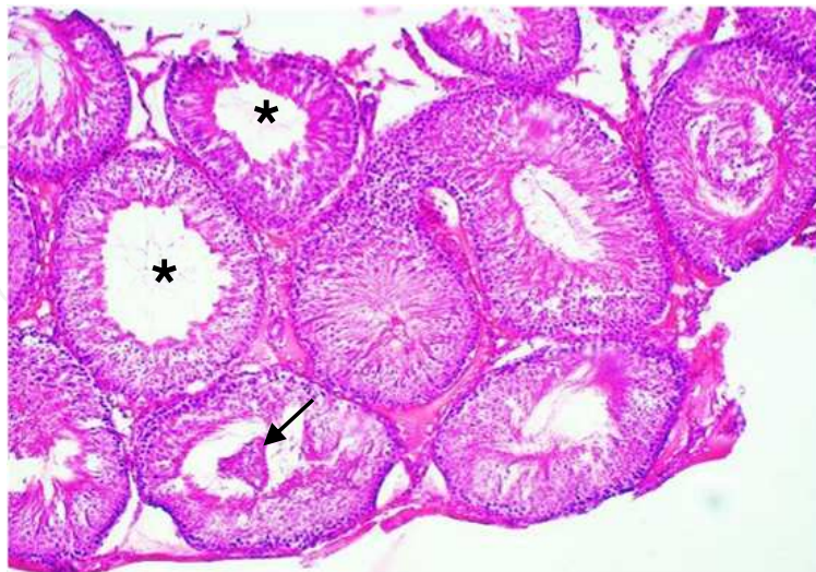
Figure 3. Representative histological section of testis from aminocarb-exposed rat (40 mg/kg/body weight) during 14 days. Immature germ cells (arrow) within the lumen of seminiferous tubules; some tubules (*) denoted a decrease on germ cell layers; haematoxylin-eosin stain. Original magnification: \times 100 .