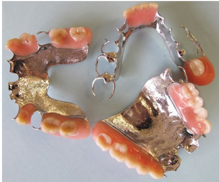
Figure 1. A typical collection of prosthetic devices, including flippers, removable partial dentures.