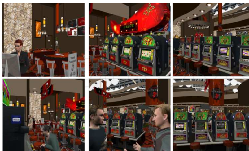
Figure 2. Screenshots of the virtual casino Les 3Dés / The 3Dices

A hierarchy has been constructed in the virtual bar to guide interventions, with users progressively approaching the machines where they can gamble (see steps 1 to 7 on Figure 3) and,