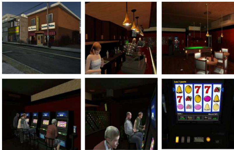
Figure 1. Screenshots of the virtual bar Chez Fortune / At Fortune

The virtual bar (named Chez Fortune / At Fortunes ) and the virtual casino (named Les 3Dés / The 3Dices ) were created at the Cyberpsychology Lab of UQO with the intention of simulating a gambling situation without the use of real money (see Figure 1 and 2). Any resemblance with real locations and these fictive locations is fortuitous.