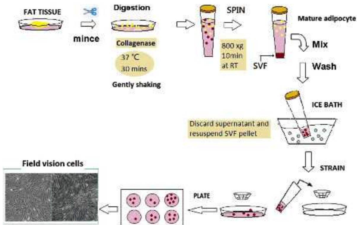
Figure 2. The preparation and isolation process, RT=room temperature, SVF=stromal-vascular cell fraction [3]

in future concepts the dental pulp cells from third molars might be preserved and stored for later use in cell based autologous tissue regeneration.