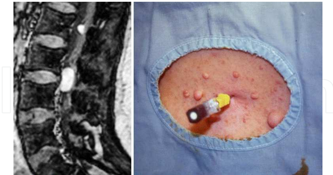
Figure 3. Forty-year-old patient with multiple neurofibromatosis. She was anesthetized successfully with spinal anaesthesia for an abdominal hysterectomy. The back of the patient shows numerous skin tumours and some cafe au lait spots. The sagittal image of the lumbar spine in post-spin echo fat-suppressed contrast demonstrates intradural solid tumours in cauda equina nerves.