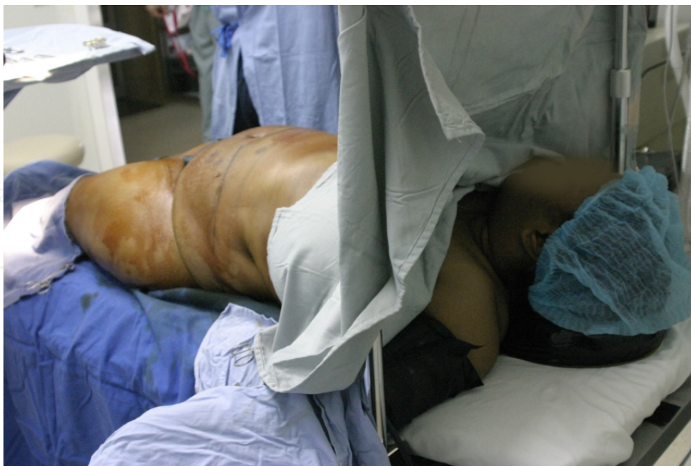
Figure 1. Large areas of skin prepped with a Povidone-iodine solution and uncovered during surgery favour hypothermia and its complications.

It is crucial to warm the patient with blankets, surgical thermal mattresses, forced air heaters, by using pre-warmed irrigation, intravenous solutions and blood products in order to decrease the severity of this complication.