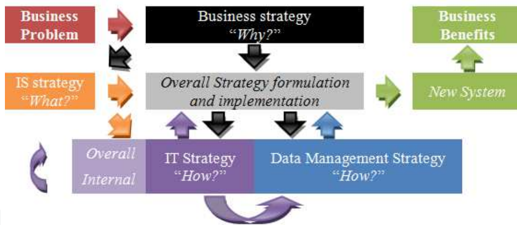
Figure 1. TRANSMIT project overall strategy approach

At the heart of any data related activity is Data Governance (DG). DG is the core function of DM that guides how all other functions are performed and it can be defined as “the exercise of authority and control over the management of data assets” [4]. DG consists of two groups of activities, namely planning and controlling. There are seven planning activities that comprise the DG function, and are typically implemented sequentially. The first two are relevant to our discussion, which are to understand the data/information needs, i.e. of the IPDM prototype, and based on these needs to develop a data management strategy. Moreover, the execution of the DG planning activities, and thus the definition of data strategy, should be driven by both business and IT strategies [4]. In Figure 1, we present a novel framework that captures this dependency by depicting the different components of the overall TRANSMIT project’s strategy and the relationship between them. This novel framework is based on a proper combination of the framework for IT, Business and Data strategies’, described in [4], with the IT, IS (Information System) and Business Strategies’ framework in [5].