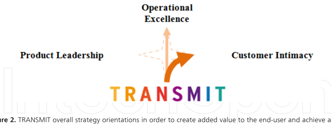
Figure 2. TRANSMIT overall strategy orientations in order to create added value to the end-user and achieve a competitive advantage, based on the three dimensions defined in [15].

To ensure the sustainability of the TRANSMIT endeavor, a clear differentiation of the TRANSMIT approach with respect to competitors have to be foreseen. In Figure 2, the primary strategic direction [15] that was chosen is the “customer intimacy” or “customer focus”. This practically means that the business improvements offered in the form of services or products are tailored to the needs and processes of individual customers (i.e. Fugro) by solving their business problem. Product leadership, which implies continuous and rapid introduction of new products and services, was difficult to be achieved given the complexity of the business problem, the existing competition, such as NASA, ESA and NOAA just to name a few, and the nature of TRANSMIT project. In the next two sections however we will see how the operational excellence can be targeted/supported by the IS, IT and Data strategies, as a secondary improvement dimension, which in principle requires improvement/optimization of business performance.