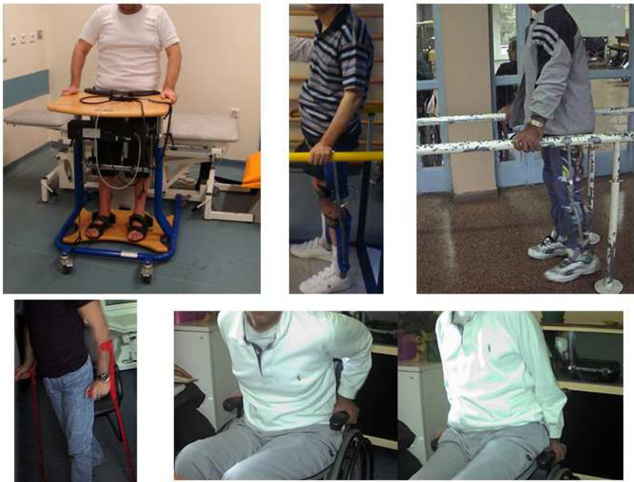
Figure 3. Weight bearing in disabled subjects; using standing frames, functional walking with orthoses between bars and crutches, even push-ups in the wheelchair (in case of multiple sclerosis with a clinical equivalent like tetraplegia) bone can be loaded and bone loss rate would be slower.

therapy program unchanged or to receive 9 minutes of side-alternating WBV (Vibraflex Home Edition II ® , Orthometrix Inc) no effect on areal BMD at the lumbar spine was observed, while areal BMD seemed to decrease somewhat in the cortical region of the femoral diaphysis. Authors explained that mechanical stimulation increases intracortical bone remodeling and thereby cortical porosity; moreover changes occurred in ways that are not reflected by areal BMD, but might be detectable by more sophisticated techniques such as peripheral quantitative computed tomography. [70] Low-intensity vibration (LIV) has shown to be associated with improvement in bone mineral density in post-menopausal women and children with cerebral palsy. Seven non-ambulatory subjects with SCI and ten able-bodied controls underwent transmission of a plantar-based LIV signal ( 0.27 \pm 0.11 g; 34 Hz) from the feet through the axial skeleton as a function of tilt-table angle (15, 30, and 45 degrees). SCI subjects and controls demonstrated equivalent transmission of LIV, with greater signal transmission observed at steeper angles of tilt which supports the possibility of the utility of LIV as a means to deliver mechanical signals in a form of therapeutic intervention to prevent/reverse skeletal fragility in the SCI population. [71]