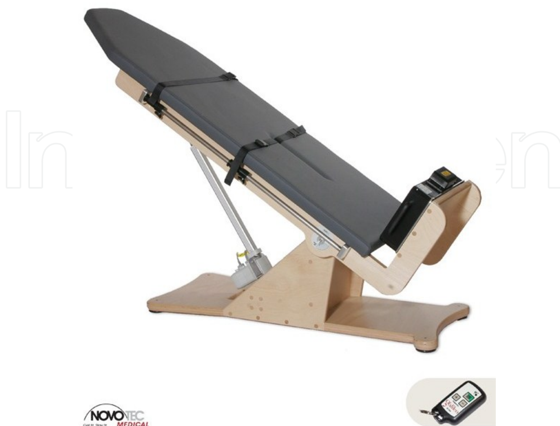
Figure 4. The Galileo Delta A TiltTable offers a wide variety of applications from relaxation to muscle training for a diverse range of patients who are unable to stand without support. The motor driven adjustable tilt angle of the Galileo Delta TiltTable (90°) allows vibration training with reduced body weight from 0 to 100%. This is ideal for deconditioned and disabled patients for gradually increasing training weights up to full body weight. System for application in adults (max. body height: 1.90 m) and children (max. body height: 1.50 m). The Galileo Delta A TiltTable is exclusively available from the manufacturer Novotec Medical GmbH. (published with permission).