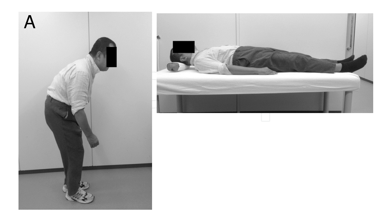
Figure 1. A patient having PD-associated camptocormia in the standing (A) and recumbent (B) positions.