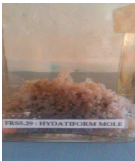
Figure 1. Gross appearance of hydatidiform mole

The mass in the uterus is made of multiple chains and clusters of cysts of varying sizes from a pin head to that of a large grape. The embryo and amniotic sac may or may not be seen. Red areas may be seen suggesting haemorrhage in the decidual space [6] (fig 1)