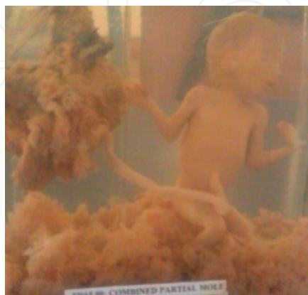
Figure 2. Specimen of partial mole.

Partial moles have triploid karyotype of both maternal and paternal origin. Partial molar pregnancies account for 10% of all hydatidiform moles [1]. In partial mole, there will be some identifiable foetal tissue (fig 2). Sanchez-Ferrer ML et al have described an extremely rare case of a partial hydatidiform mole with a normal fetus [21]. The classic clinical presentation described for complete mole is rare in partial mole and significant hCG level elevation is less common [15]. Ultrasonography will not show the classical snow-storm appearance (fig 3). Most often the diagnosis is made upon histological review of curettage specimens [15].