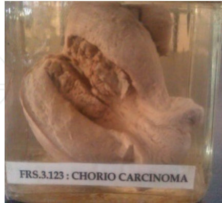
Figure 5. Specimen of choriocarcinoma of the uterus