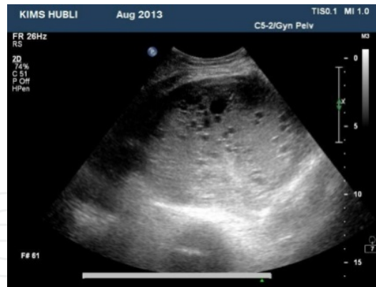
Figure 3. Transabdominal ultrasonogram showing 'snowstorm' appearance of a complete mole in the uterus.