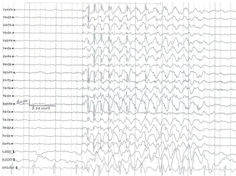
Figure 3. Photoparoxysmal response in a 20 year old female patient with JME since the age of 11 years accompanied by jerky movements of both upper extremities.