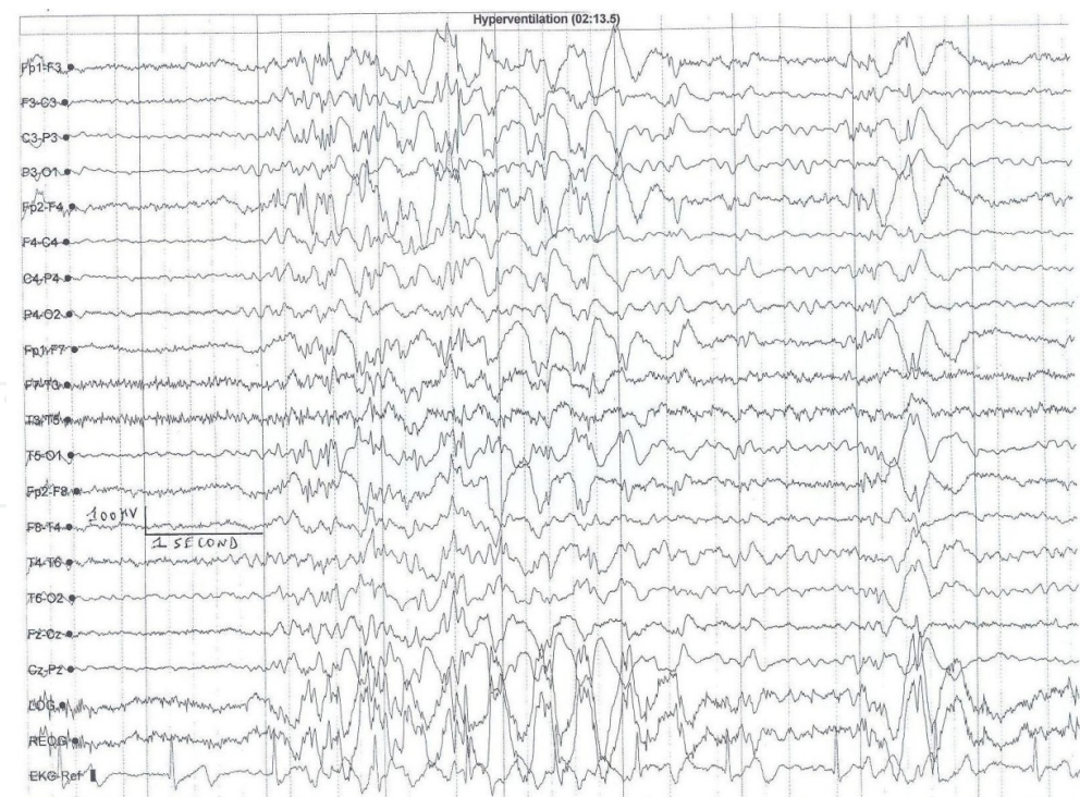
Figure 4. Same patient as in Figure 3 showing generalized polyspike-wave complexes accompanied by mild impairment of cognition during hyperventilation.