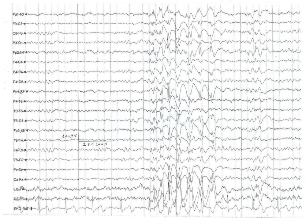
Figure 2. Thirteen year-old girl with clinical JME since the age of 9 years showing interictal polyspike wave discharges not associated with clinical manifestations.

Interictal EEG shows diffuse or generalized spike-wave (SW) and polyspike-wave (PSW) discharges at 3-6 Hz [Figure 2].