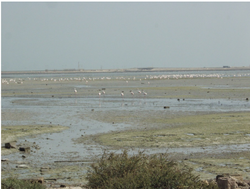
Figure 4. A mudflat along the northern coastline of Bahrain that supports wader birds is proposed to be reclaimed, which may result in a loss of important feeding grounds for bird populations (2012).