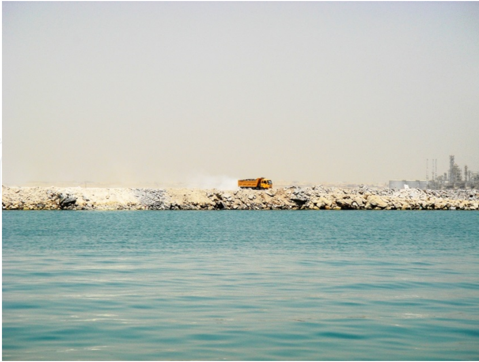
Figure 3. Rocks and sands extracted from nearby quarries are used to reclaim a coastal area along the eastern coastline of Bahrain (2012).