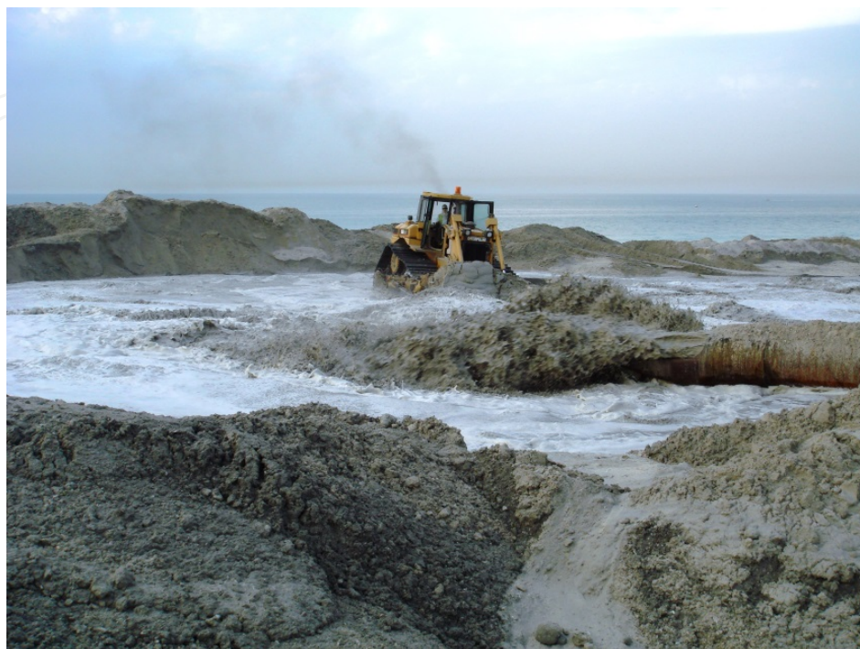
Figure 2. Sand and mud materials are pumped from a marine burrow area into the reclamation site. 'Dyar Al Muharraq' development in Bahrain (2013).

levels (Al-Wedaei et al, 2011). Dredging and reclamation activities have resulted in the loss of many prime mudflats that support shorebird populations (Figure 4), and the degradation of coral reefs due to sediment runoff and the increase levels of turbidity (Al-Sayed et al., 2008).