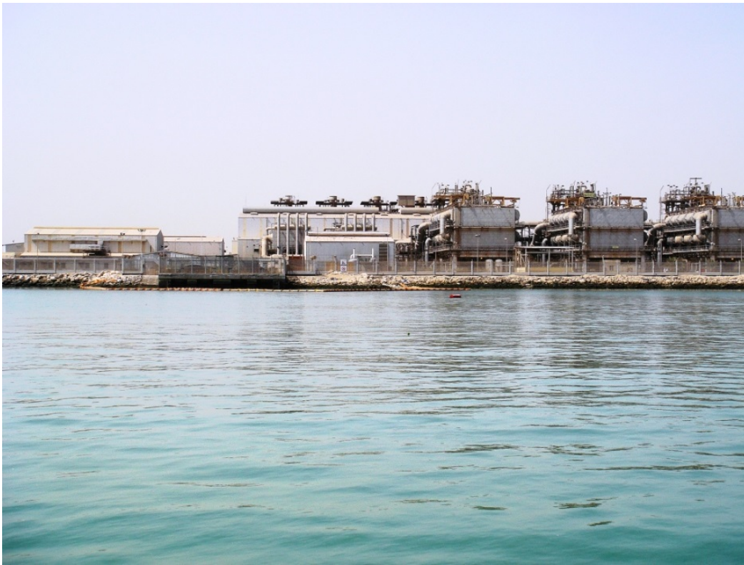
Figure 5. Marine organisms at the proximities of desalination plants are influenced by chemical, physical and thermal pollution. Reduced levels of diversity and abundance of macrobenthos were recorded adjacent the outlet of this MSF desalination plant along the eastern coastline of Bahrain (2012).