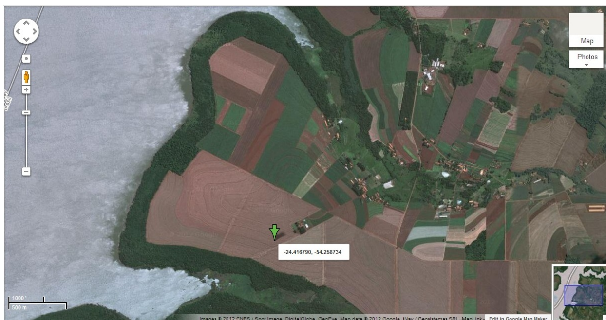
Figure 3. Local where the experiment involving fertilization with Zn in corn crop was performed [80]

used in the work, it was observed that one of the sources presented 11039.46 \text{ mg of Pb kg}^{-1} , being the maximum limit permitted by Brazilian law (NI 27/06) [37] 10000.00 \text{ mg of Pb kg}^{-1} (Table 3). However, as previously mentioned in the section 3, the NI 27/06 tolerates the presence of contaminants up to 30% of the maximum permitted value, in this way, the fertilizer would not be considered as irregular, and can be freely traded.