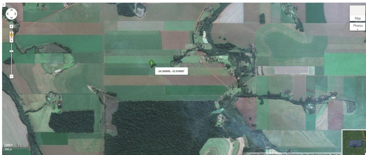
Figure 2. Local where the experiment involving fertilization with Zn in soybean and wheat culture were performed [80]

used in the work, it was observed that one of the sources presented 11039.46 \text{ mg of Pb kg}^{-1} , being the maximum limit permitted by Brazilian law (NI 27/06) [37] 10000.00 \text{ mg of Pb kg}^{-1} (Table 3). However, as previously mentioned in the section 3, the NI 27/06 tolerates the presence of contaminants up to 30% of the maximum permitted value, in this way, the fertilizer would not be considered as irregular, and can be freely traded.