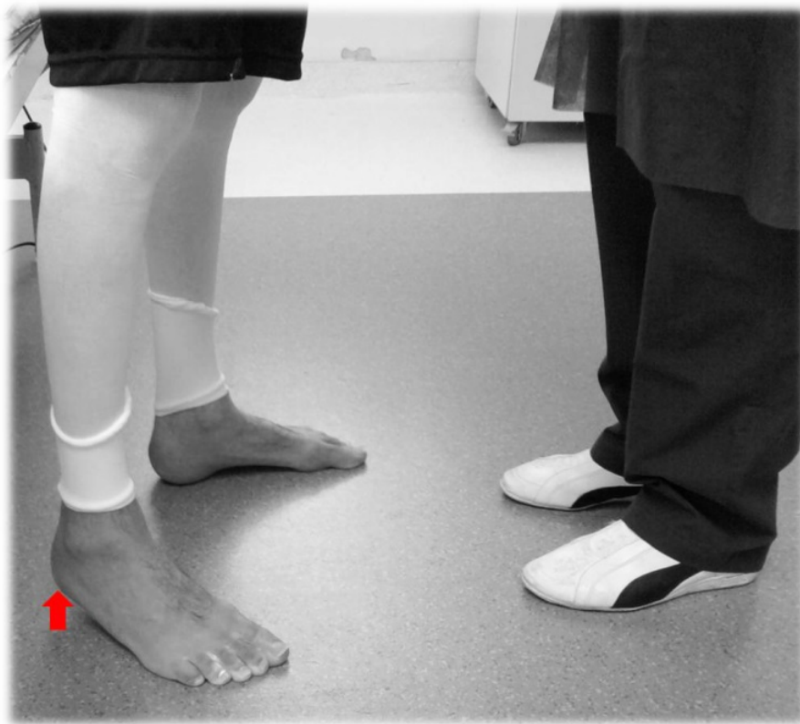
Figure 3. Standing unassisted post final cast without right heel contact on the floor.

Right wrist was extended and fingers flexed. Left wrist was in extreme flexion with metacarpophalangeal (MCP) joints in extension.