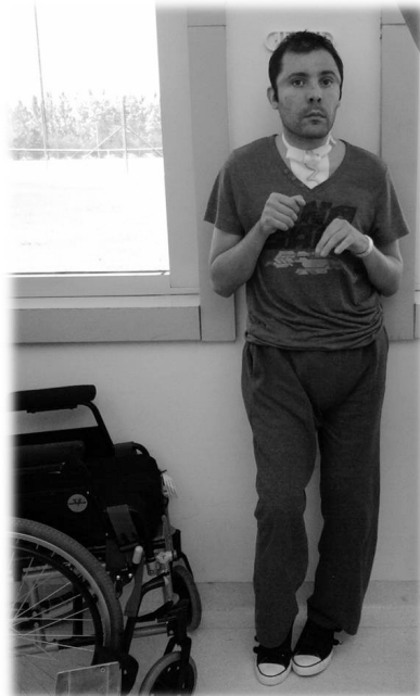
Figure 8. Standing as the final result of the progression of serial casting.

The right hip range limitation was solved surgically several months later. Currently, patient walks independently, requiring supervision for cognitive deficit. As for the upper limbs, right elbow regained normal mobility with conventional therapy and left elbow and wrist flexors required a tendon lengthening surgery.