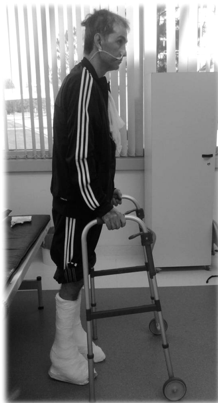
Figure 1. Independent standing with the first of the series of four casts.

Patient quickly recovered skills such as sitting and standing independently, so the team decided to apply four serial casts (Fig. 1). These were changed every 7 to 14 days for a total program duration of two months.