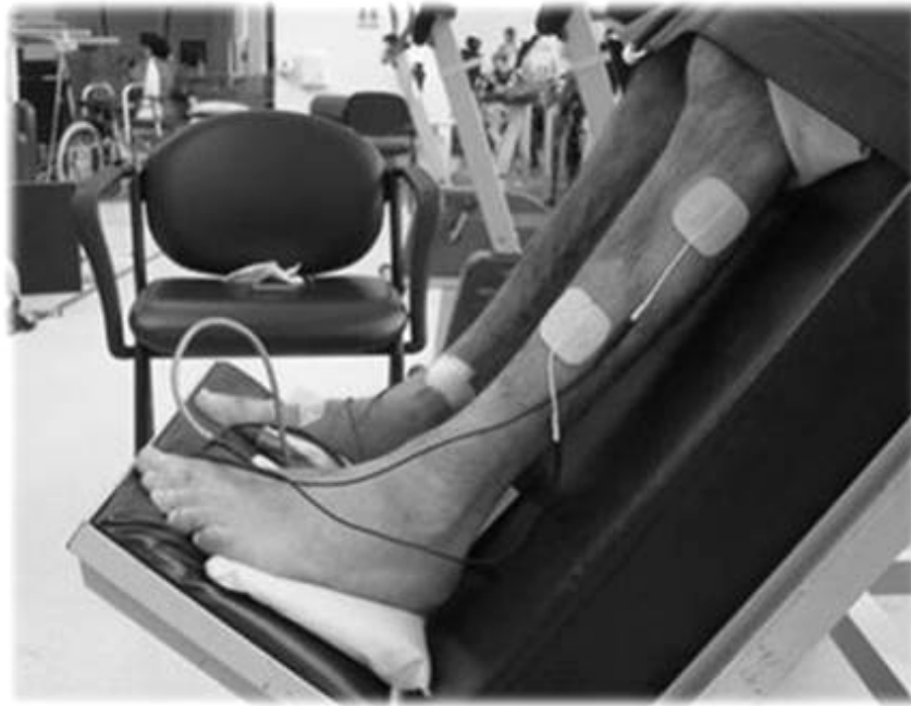
Figure 2. Stretching with electro-therapy on tilt table between casts.

Patient was allowed to rest for 2 days between casts, during which time he continued to stand using the standing frame with therapist assistance and received electro-therapy (Fig. 2).