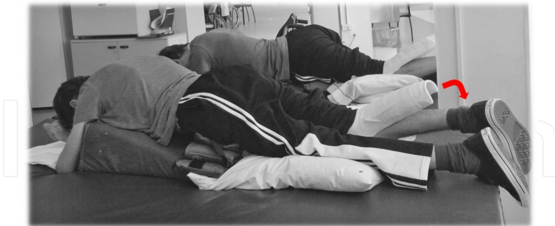
Figure 6. Prone position and exercise with Drop out cast in left knee.